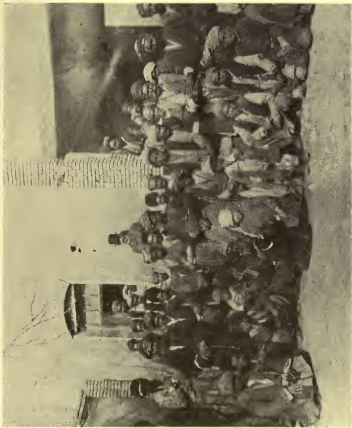
Dispensary Day (outdoors)