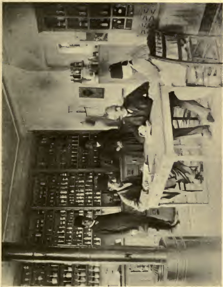
Dispensary Day (indoors)