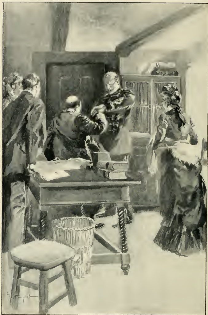
HE THREW THE ABBÉ BACK.