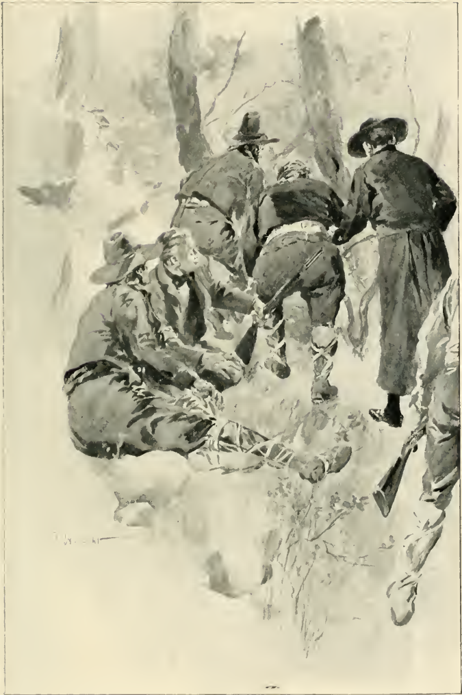
THEY SLOWLY COCKED THEIR OLD-FASHIONED SINGLE-BARRELLED GUNS.