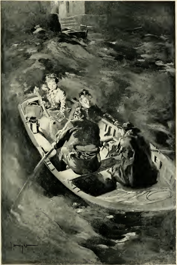
THEY PULLED SLOWLY OUT.