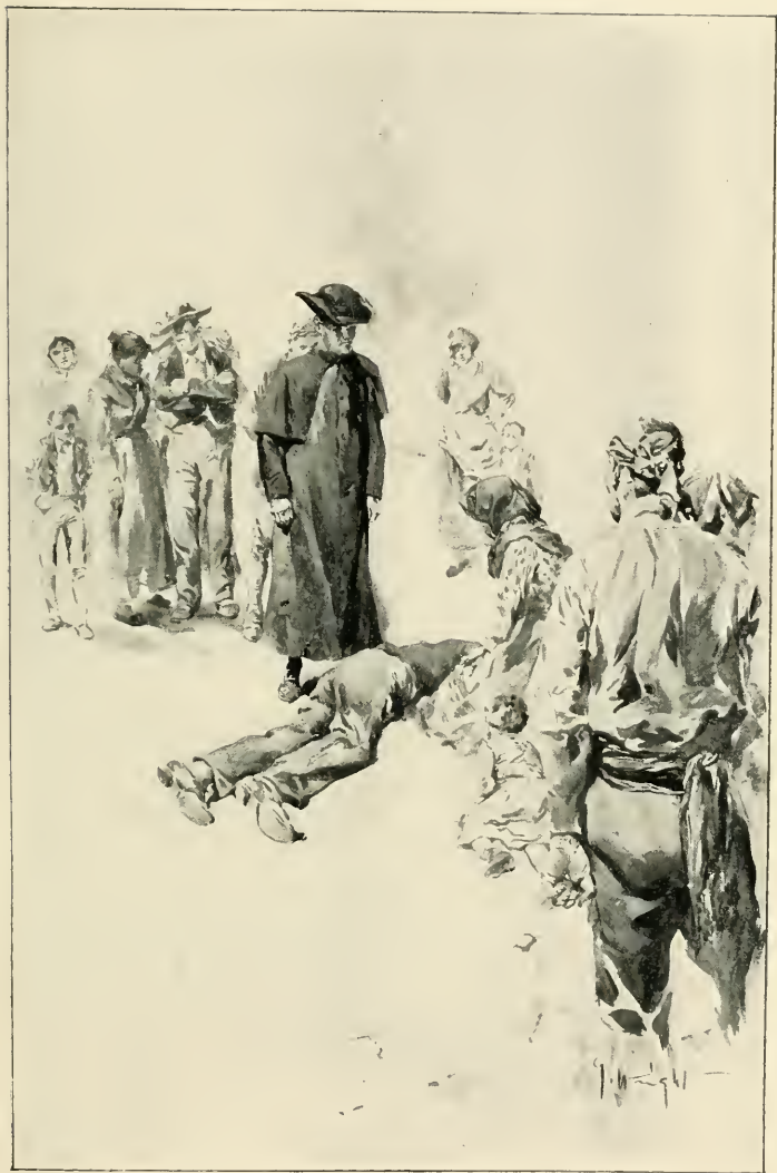
SHE KNELT BY THE DEAD MAN'S SIDE.