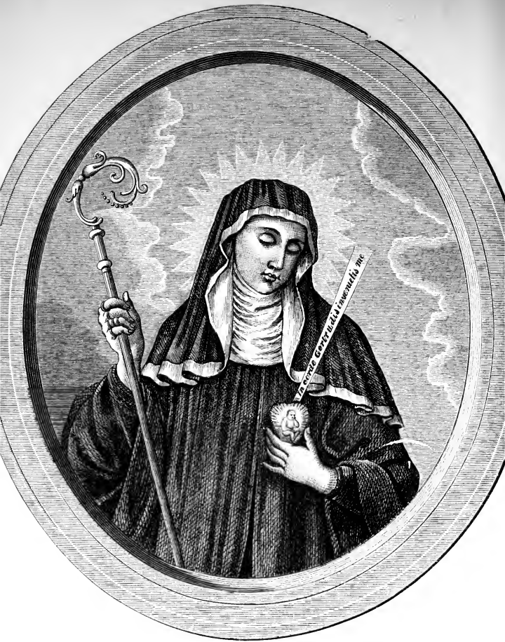
ST. GERTRUDE THE GREAT.

Engraved from the Spanish miraculous Painting.