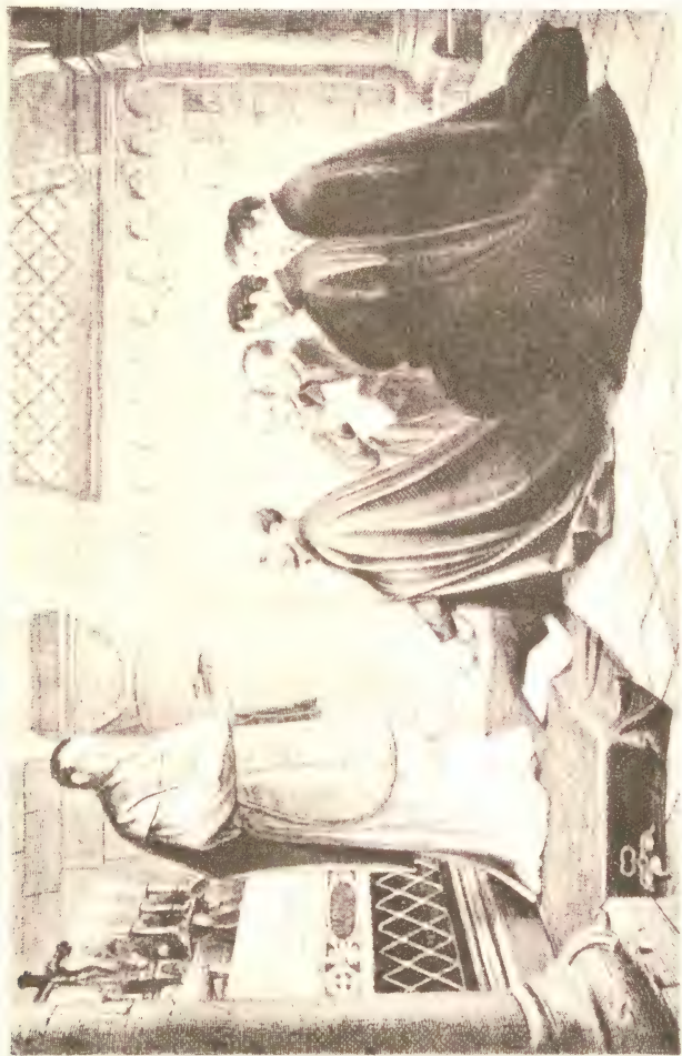
THE FIRST VOWS AT MONTMARTRE.