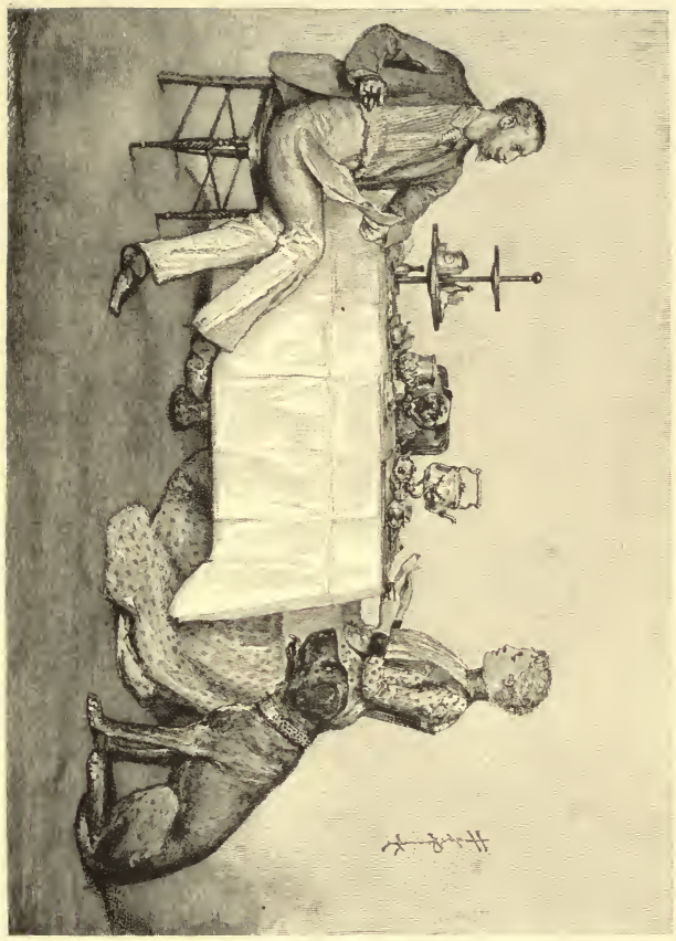
"THE MOST EXCITING PART."