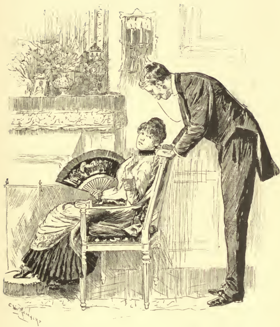
SHE LOOKS FONDLY UP INTO THE FACE OF HER HUSBAND FOR APPROVAL.