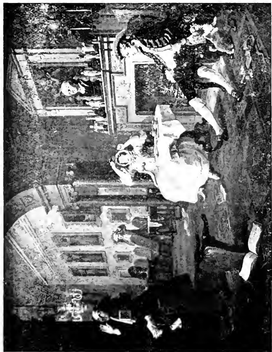
MARRIAGE A LA MODE, SCENE II Hogarth