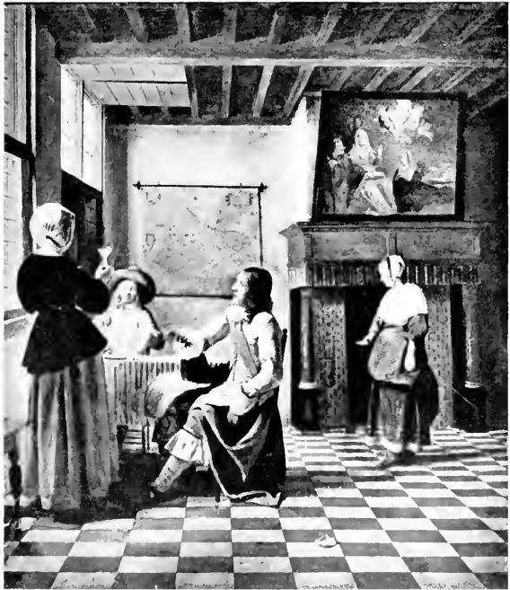
A DUTCH INTERIOR