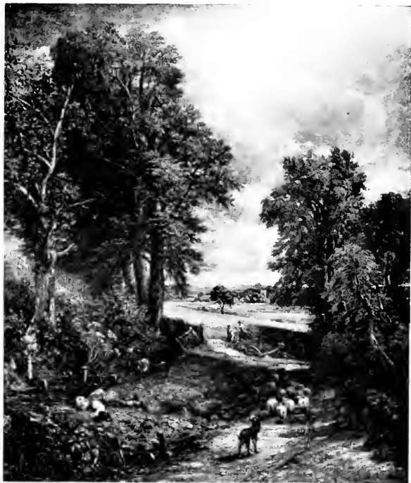
THE CORNFIELD Constable