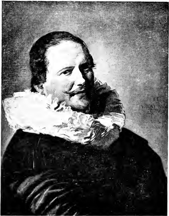
A MAN'S PORTRAIT