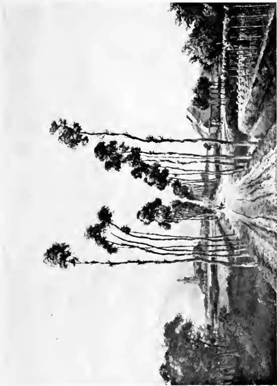
THE AVENUE Hobbs