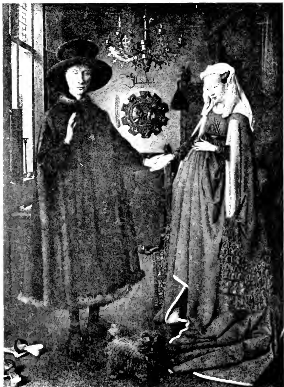
JAN ARNOFFINI AND HIS WIFE