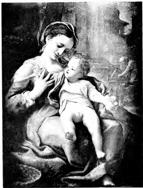
MADONNA OF THE BASKET