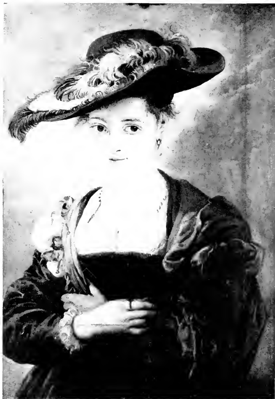
CHAPEAU DE POIL.