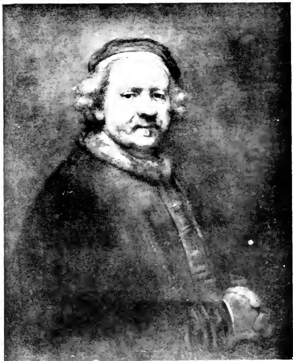
PORTRAIT OF HIMSELF Rembrandt