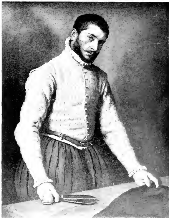
PORTRAIT OF A TAILOR