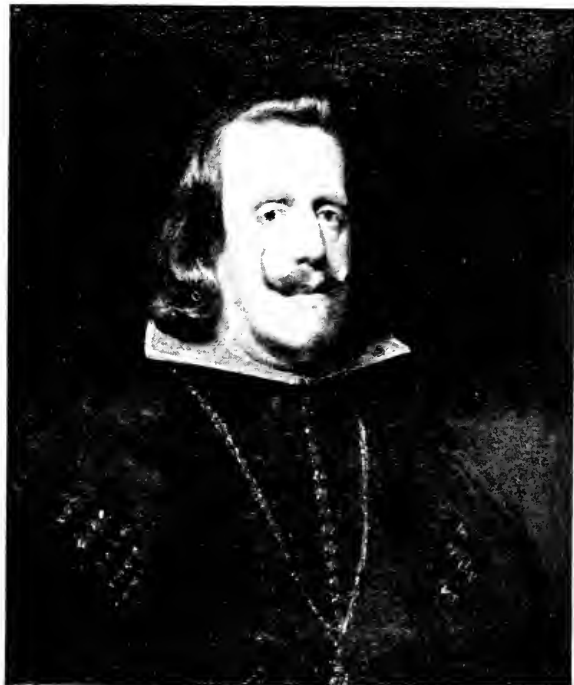
PHILIP IV Velázquez