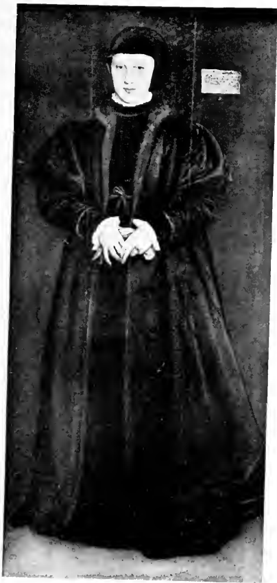
DUCHESS OF MILAN Holbein