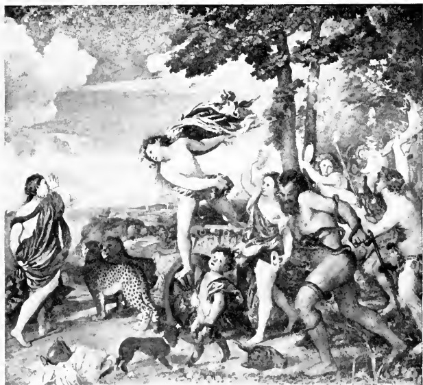
BACCHUS AND ARIADNE Titian