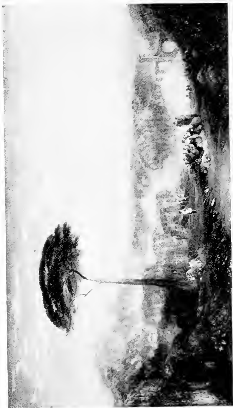
CHILD HAROLD'S PILGRIMAGE Turner