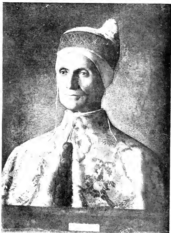
DOGE LEONARDO LORENDANO