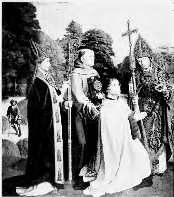
A CANON AND HIS PATRON SAINTS Gerard David