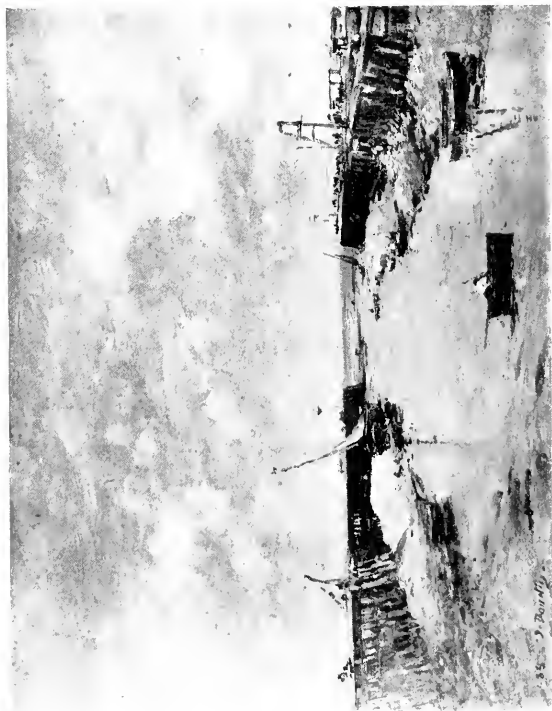
HARBOUR AT TROUVILLE Bouffé