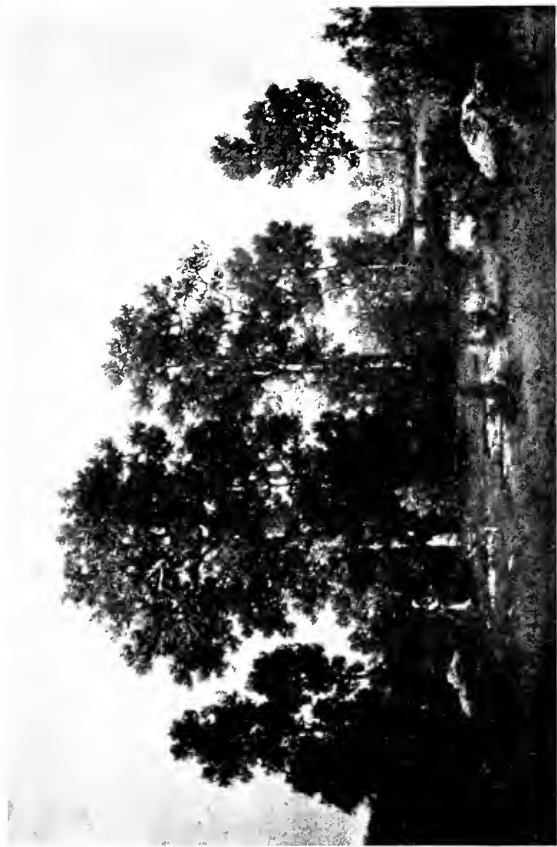
SUNNY DAYS IN THE FOREST