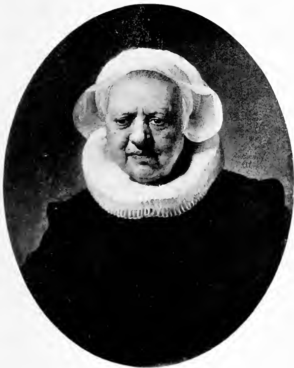
AN OLD LADY