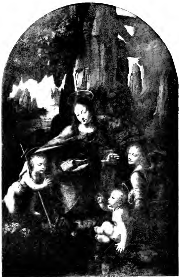
OUR LADY OF THE ROCKS