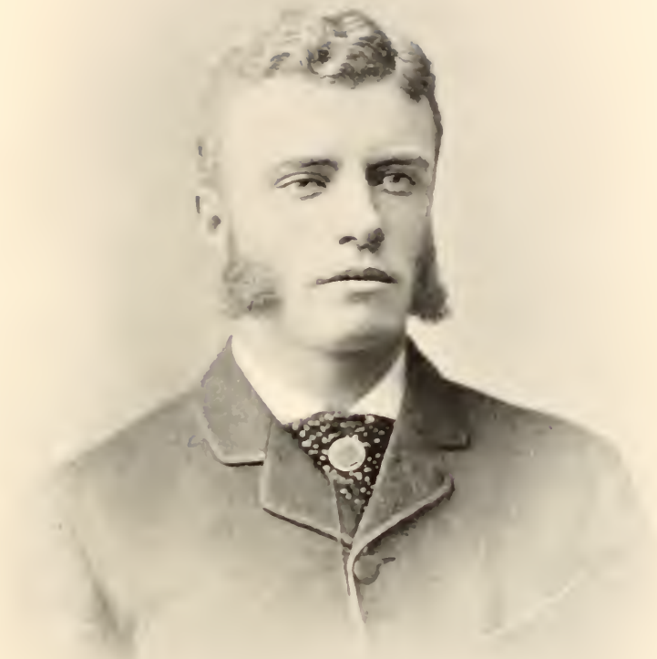
THEODORE ROOSEVELT At the time of his Graduation in 1886