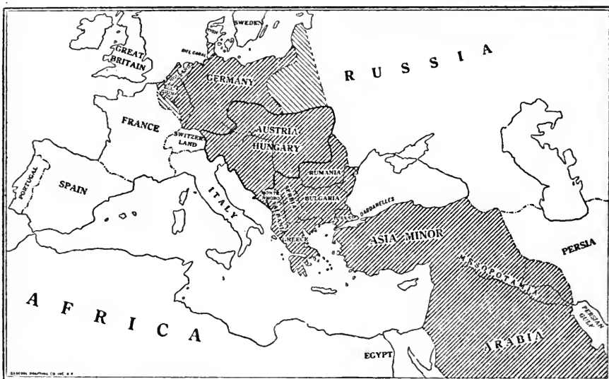
GERMANY'S PROPOSED FOUNDATION FOR HER NEXT WAR

This basic part of the program alone meant that 127 millions of