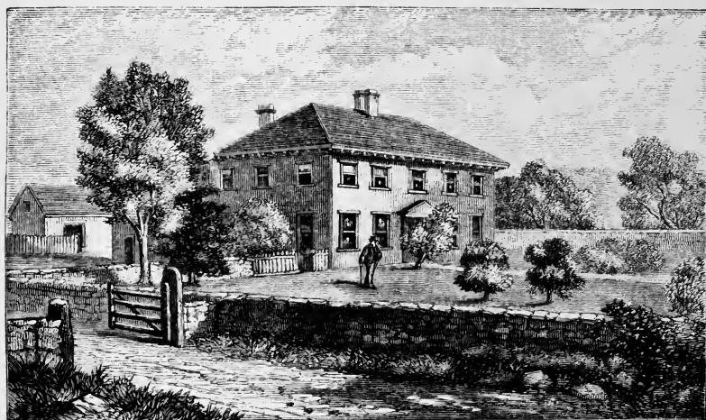
WHITEHALL, BERKELEY'S RESIDENCE IN RHODE ISLAND.

The house at Whitehall may still be seen, in its green valley, near a hill which commands a wide view of land and ocean and neighbouring islands. When asked why he built it in the valley, when he might have gratified his love of nature more if it had been placed on the high ground, Berkeley is said to have answered, with philosophic appreciation—‘To enjoy what is to be seen from the hill, I must visit it only occasionally; if the prospect were constantly in view it would lose its charm.’ The house stands a little off the road that runs eastward from Newport, about three miles from the town. The engraving here given is from drawings taken on the spot 15 .