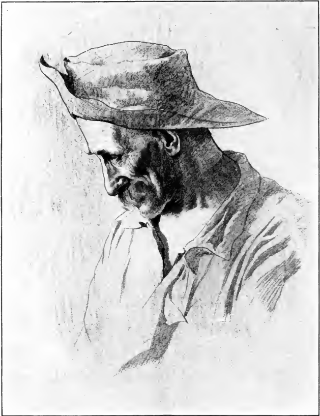
A FRESH INFUSION OF PIONEER BLOOD