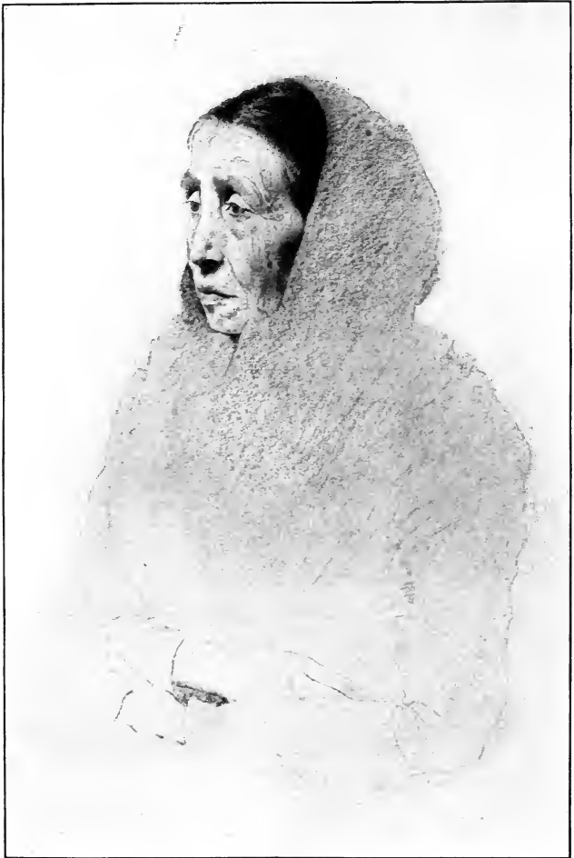
THE UNGROOMED MOTHER OF THE EAST SIDE