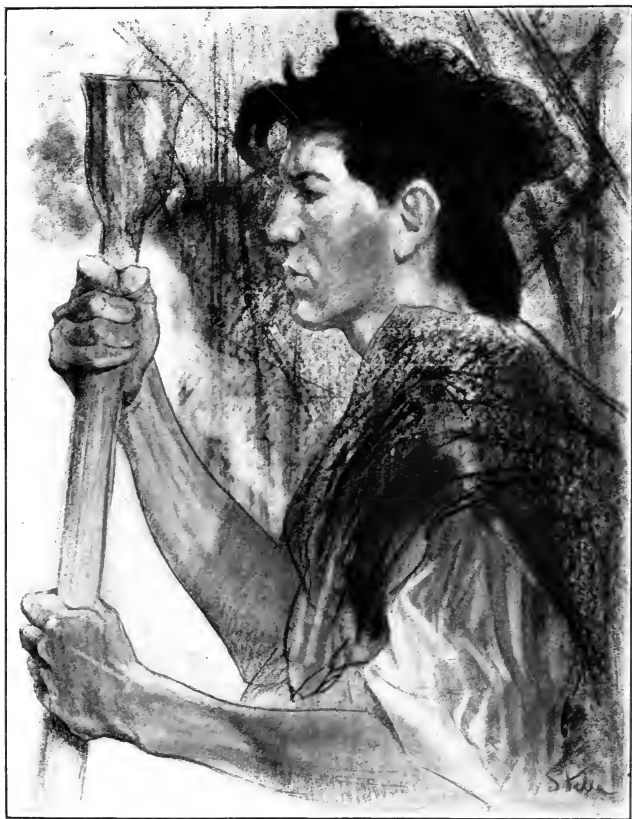
ROUGH WORK AND LOW WAGES FOR THE IMMIGRANT