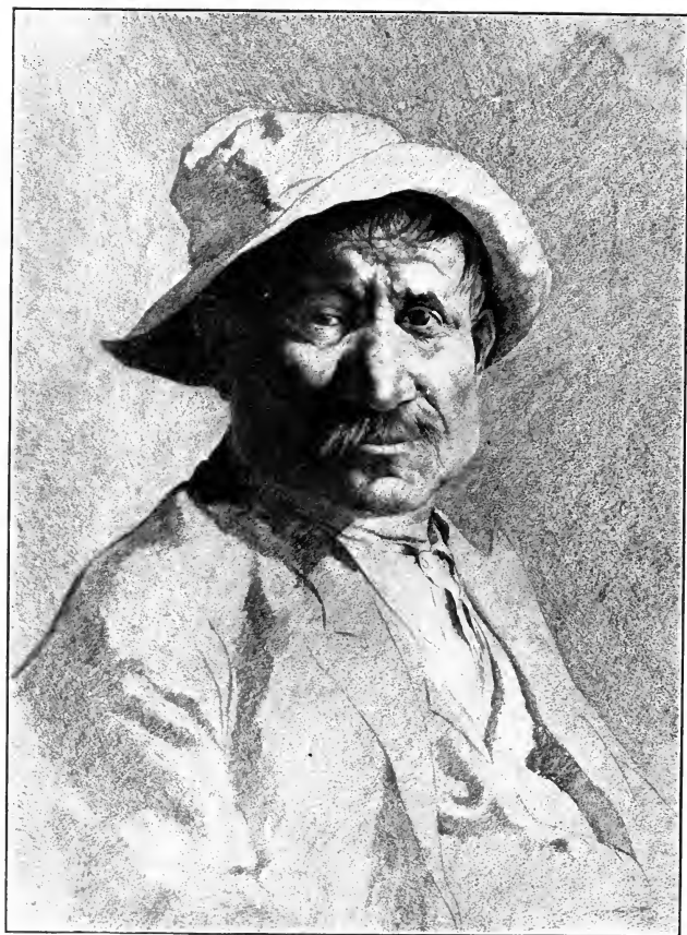
THE SINEW AND BONE OF ALL THE NATIONS