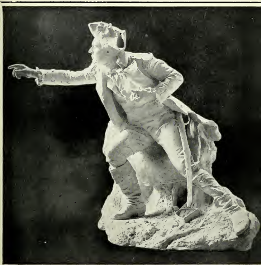
GENERAL HERKIMER'S STATUE AT HERKIMER, N. Y.