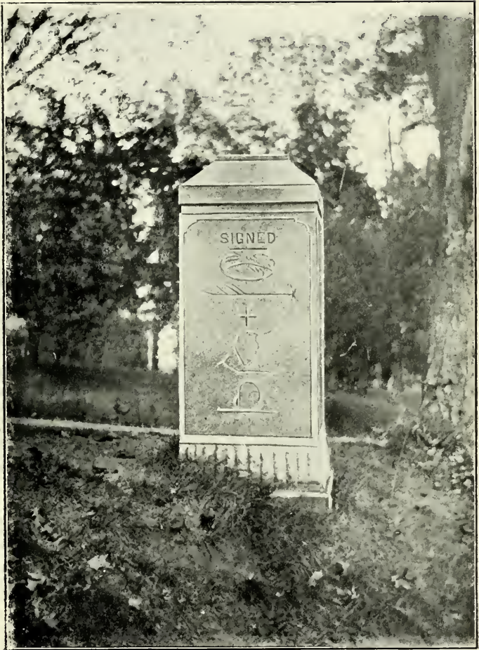
THE LINE OF PROPERTY MONUMENT.