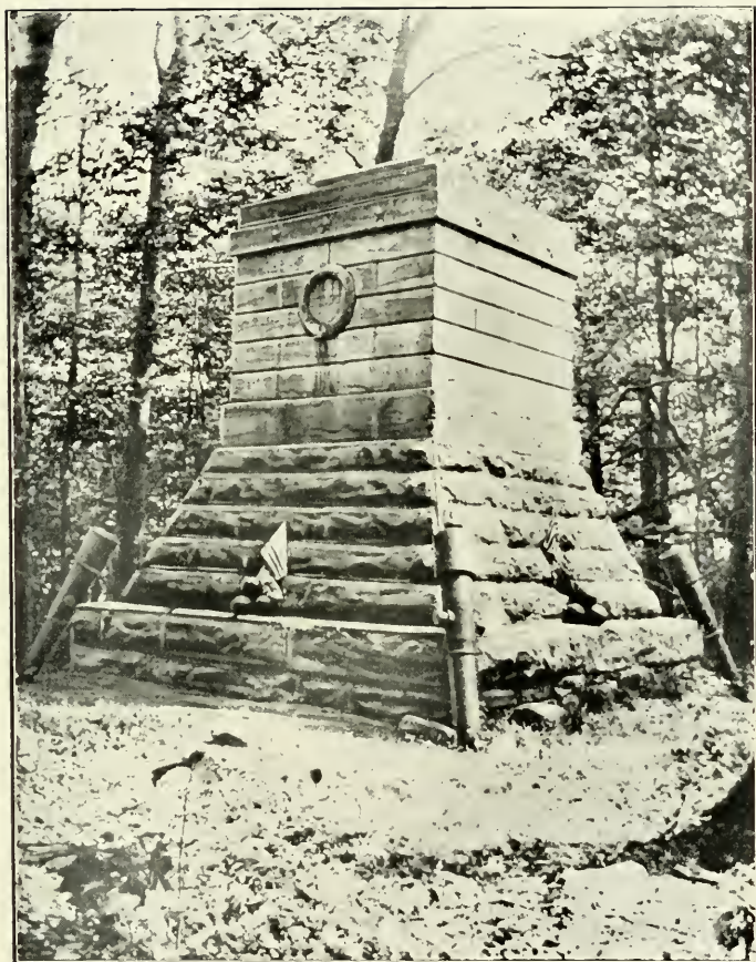
BARON STEUBEN MONUMENT.