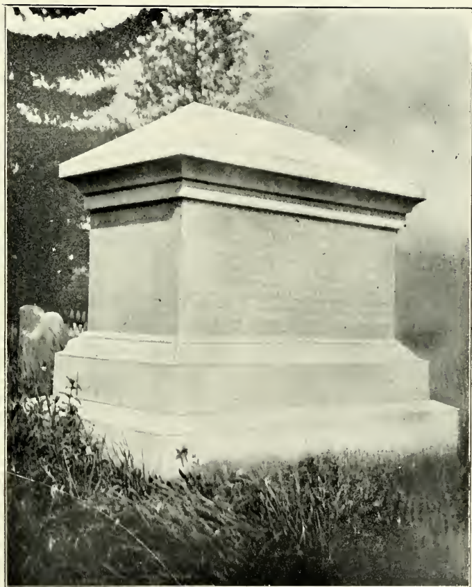
GEN. WM. FLOYD'S MONUMENT, Westernville, N. Y.