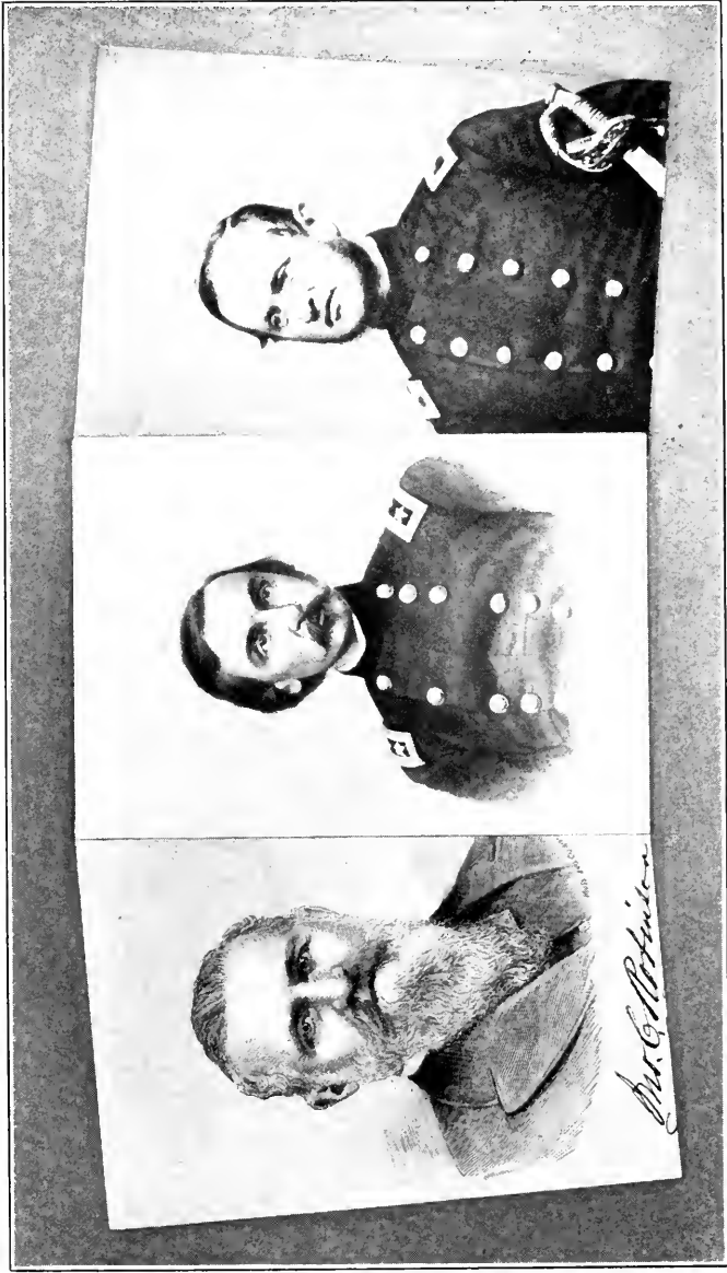
JOHN C. ROBINSON B'v't Major-General Second Div. Fifth Corps