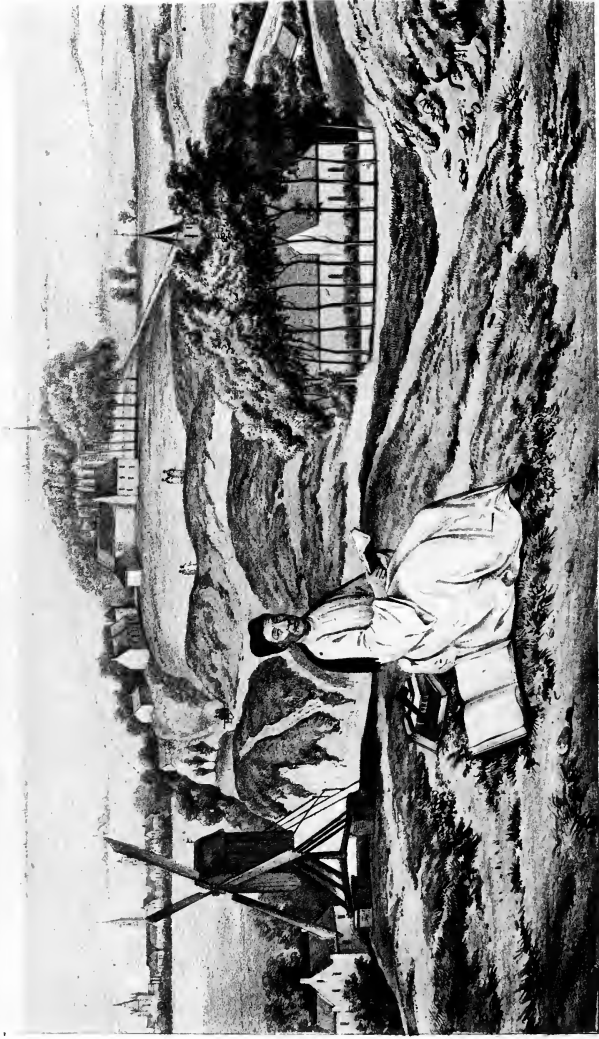
THOMAS À KEMPIS