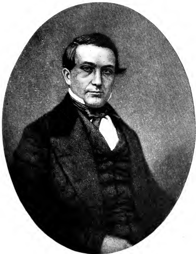
HON. PHILIP FRANCIS THOMAS Governor of Maryland, 1848-1851