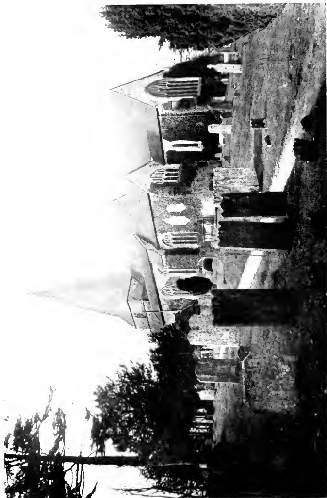
SUNDRIDGE CHURCH KENT, ENG.