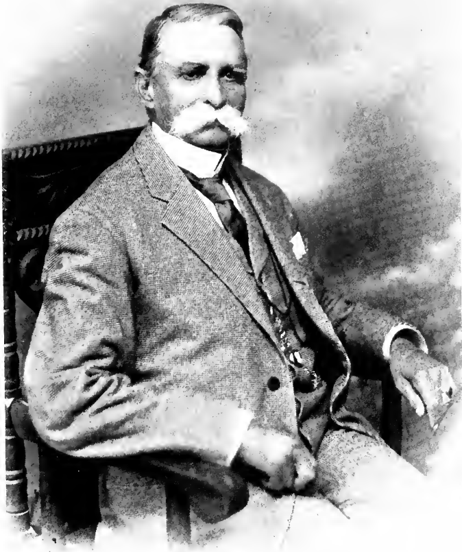
RICHARD HENRY SPENCER