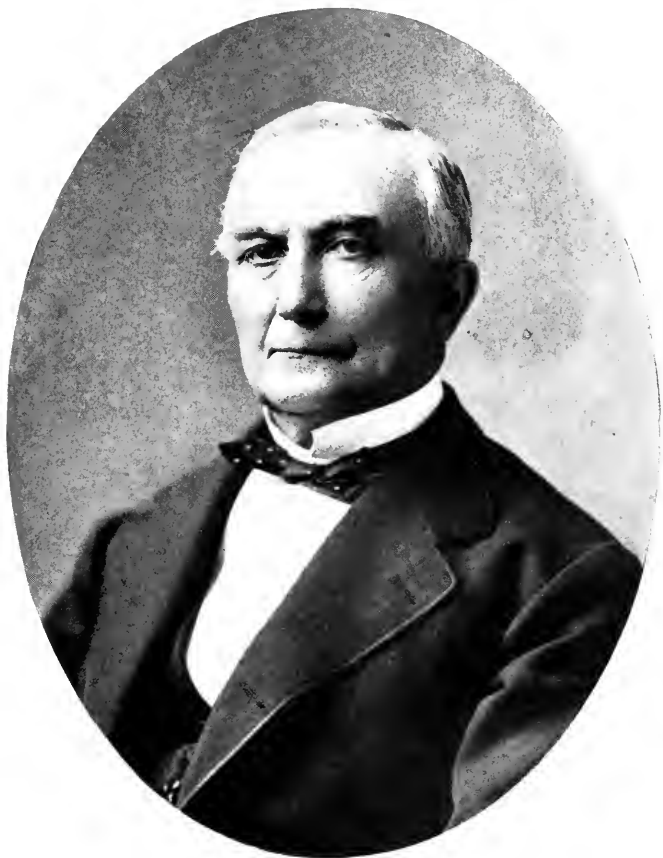
HON. PHILIP FRANCIS THOMAS 1810-1890