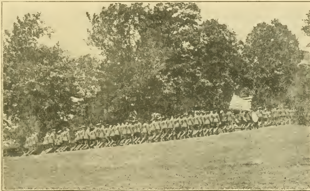
Marching up Front Avenue on Friends' Day

Entered November 23, 1903, at Boston Mass., as Second-Class matter, under Act of Congress of July 16, 1874