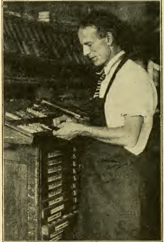
Clarence H. De Mar, A. A. F. T. S., 1903

September 1907 found the boy a student at the University of Vermont.