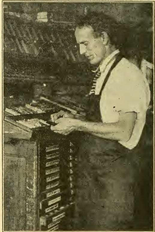
Clarence H. De Mar, A. A. F. T. S., 1903

September 1907 found the boy a student at the University of Vermont.