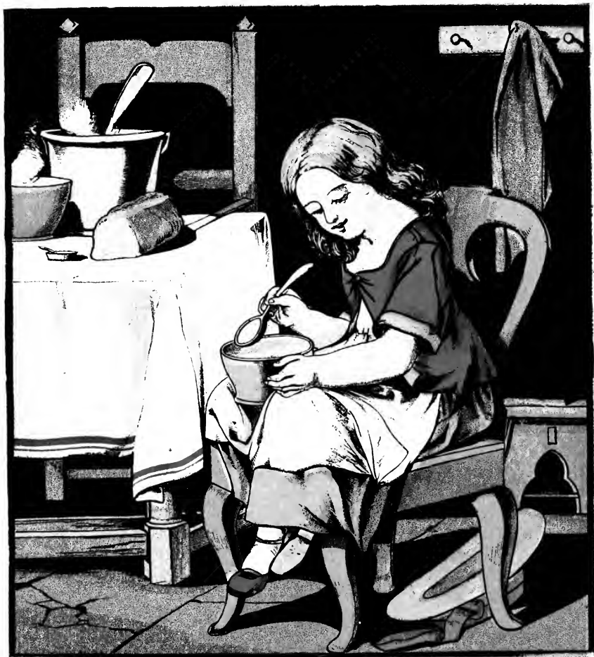
GOLDENHAIR EATS UP TINY-CUB'S PORRIDGE.