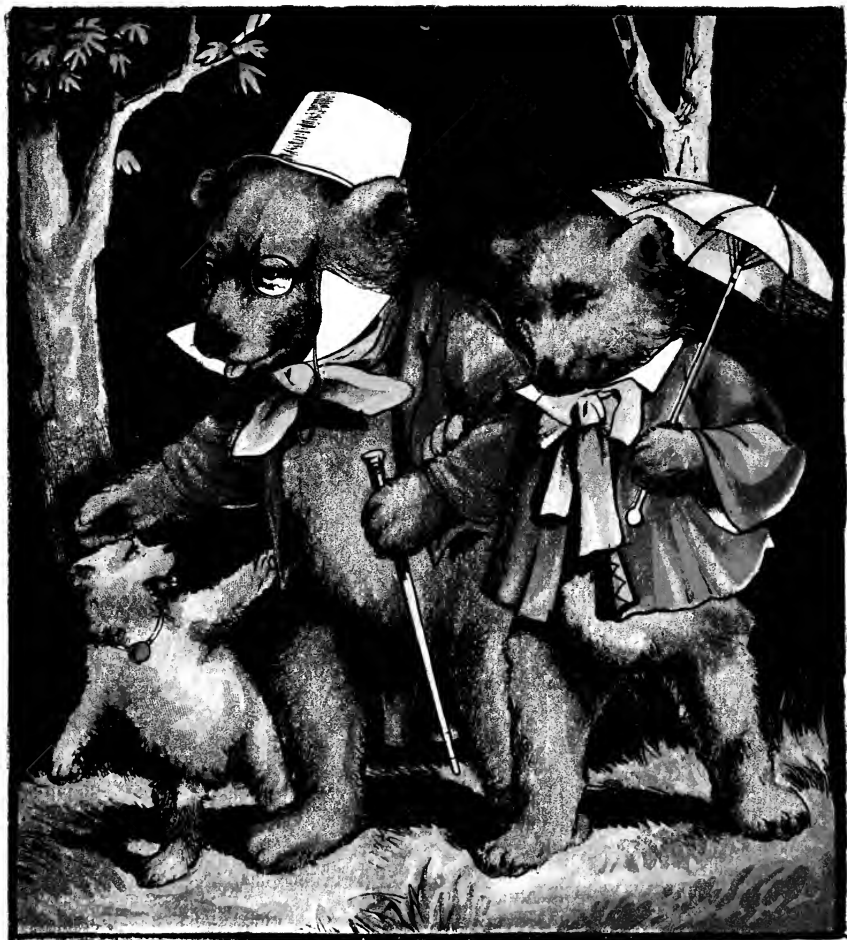
THE BEAR, WITH HIS WIFE AND SON, TAKES A WALK.