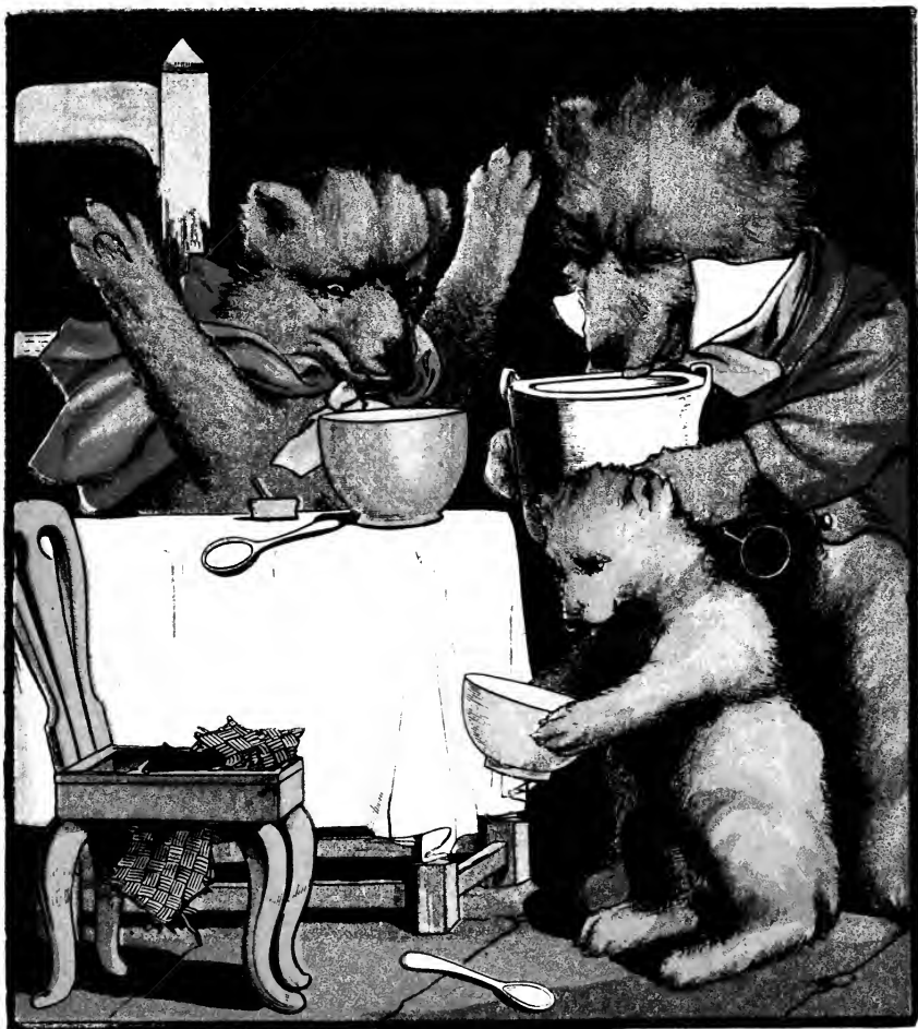
THE BEARS COME HOME AND FIND THEIR PORRIDGE ALL GONE.