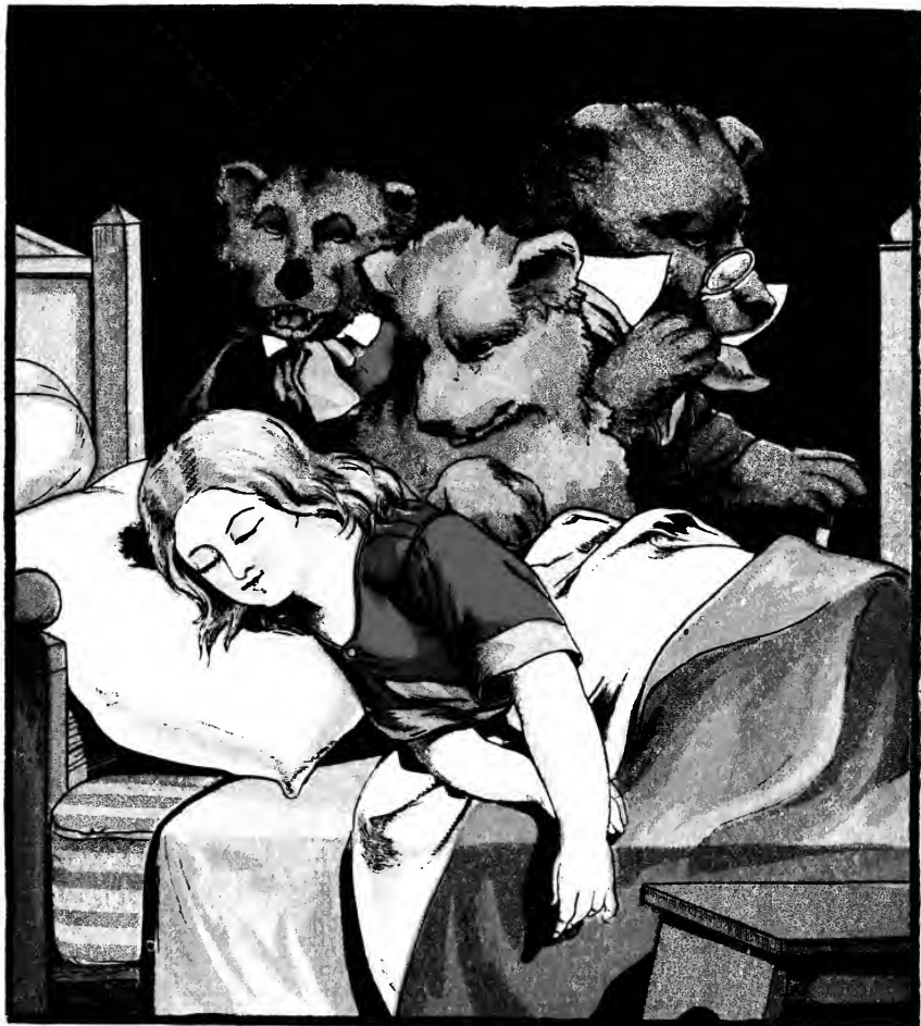
THE BEARS FIND GOLDENHAIR ASLEEP IN TINY-CUB'S BED.