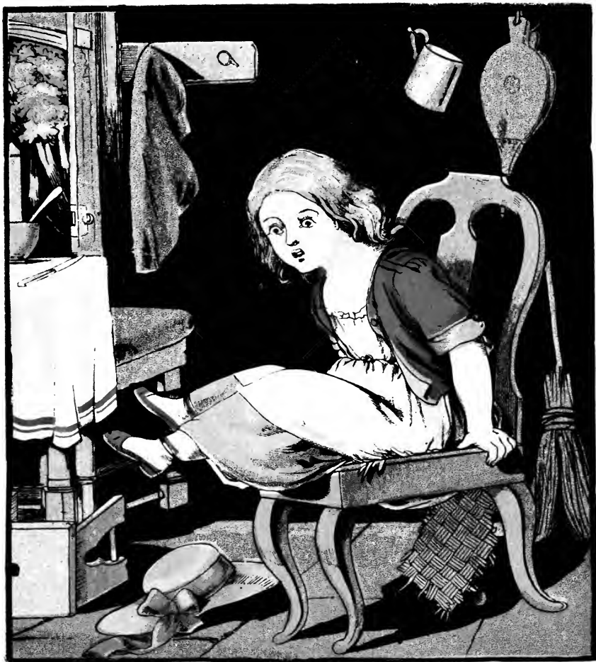
GOLDENHAIR BREAKS THE BOTTOM OUT OF TINY-CUB'S CHAIR.