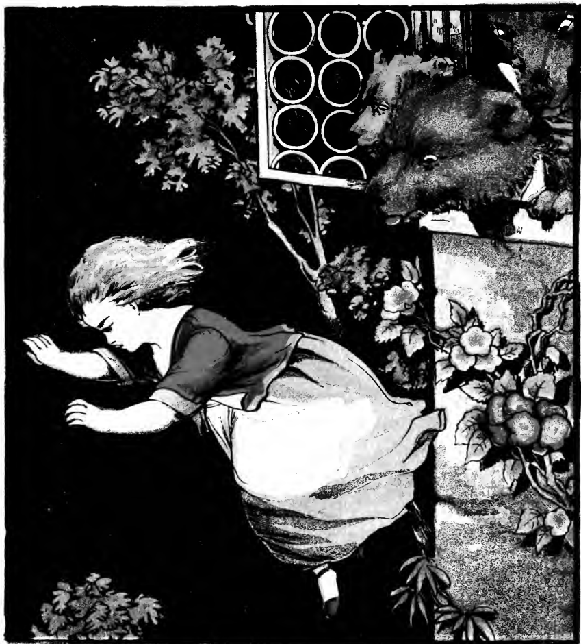
GOLDENHAIR JUMPS OUT OF THE WINDOW.