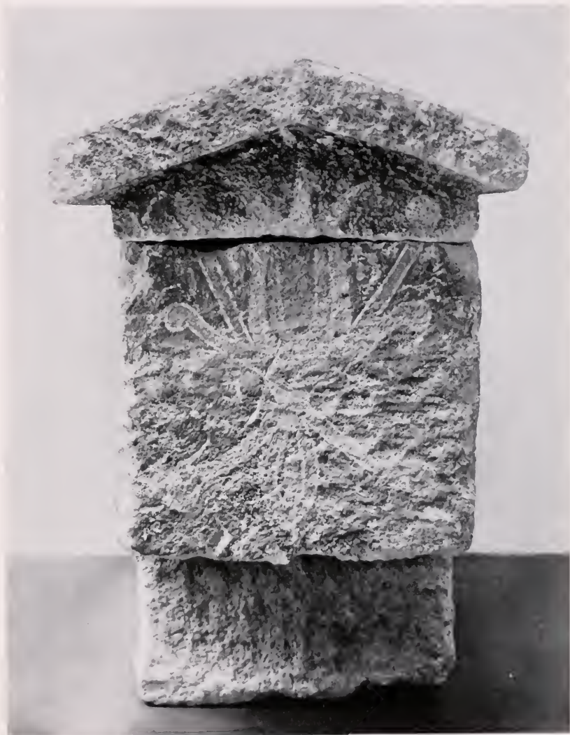
END OF SARCOPHAGUS B.