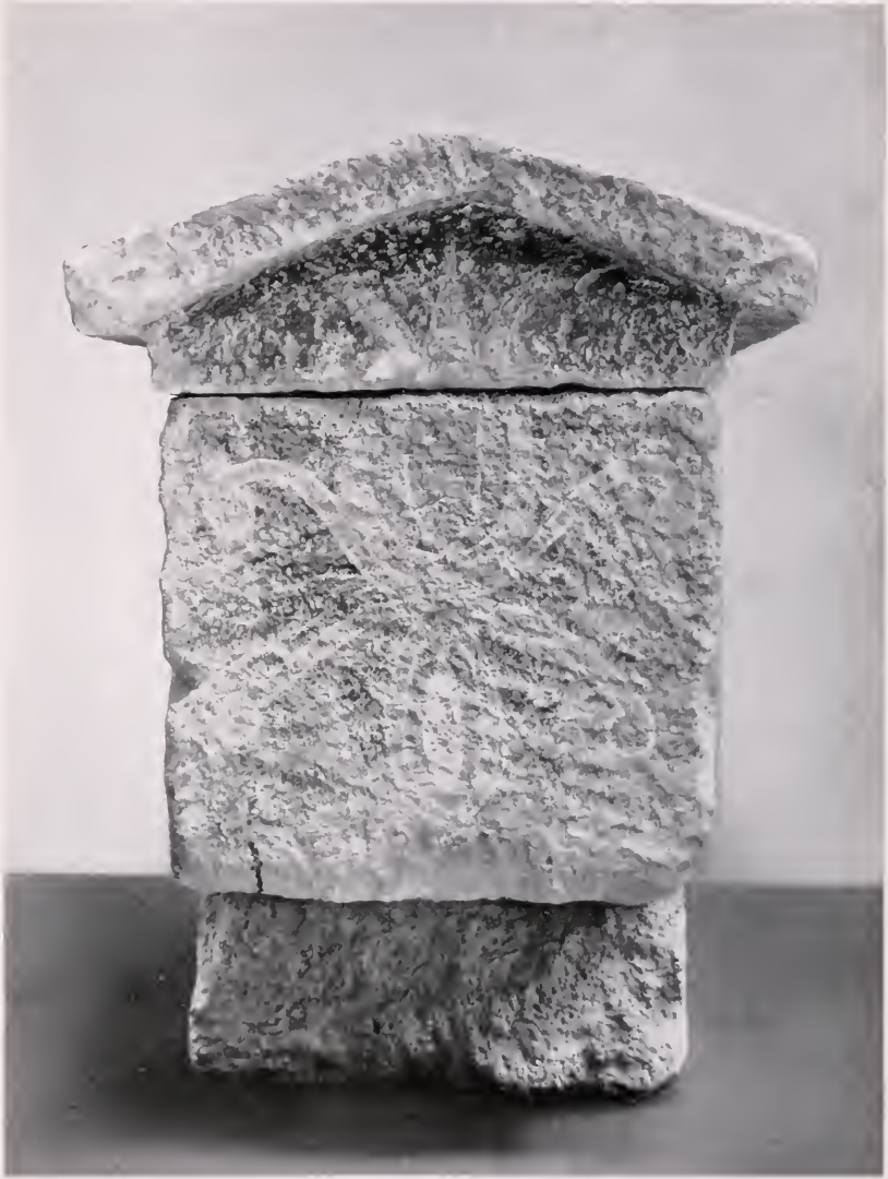
END OF SARCOPHAGUS B (OPPOSITE THE ONE IN PRECEDING PLATE).