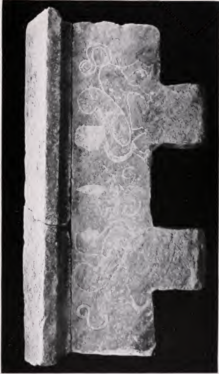
ETRUSCAN SARCOPHAGUS B.