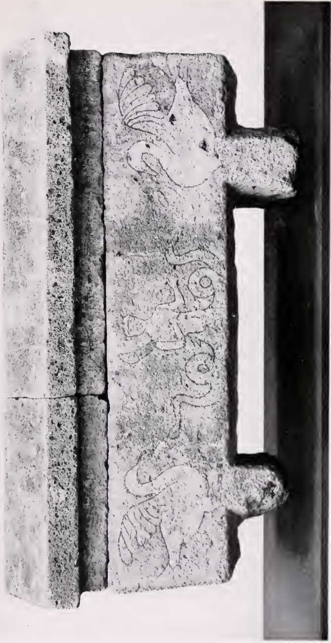
ETRUSCAN SARCOPHAGUS C.