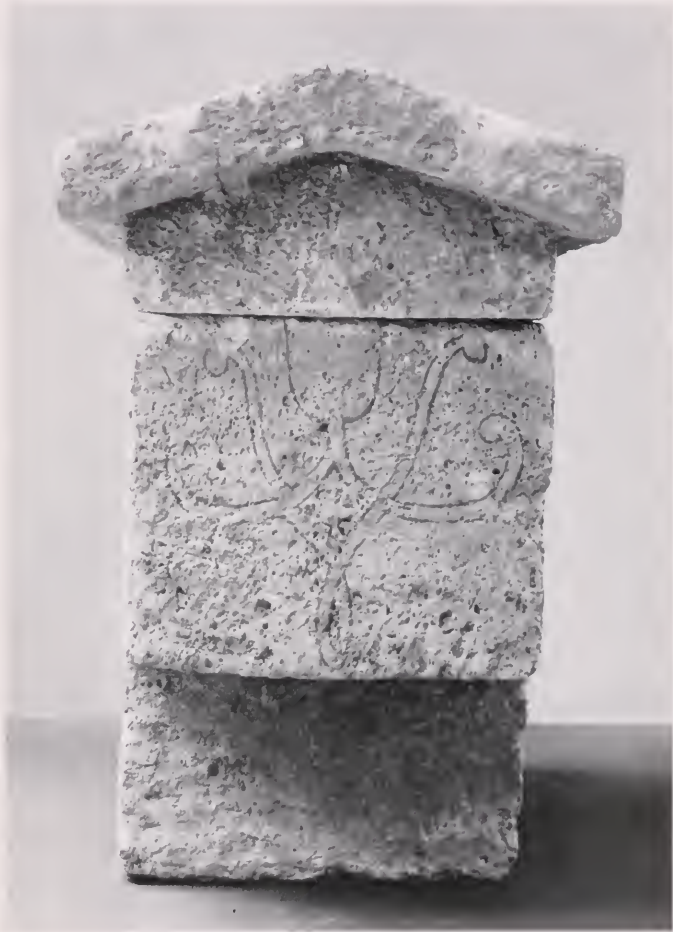
END OF SARCOPHAGUS A.