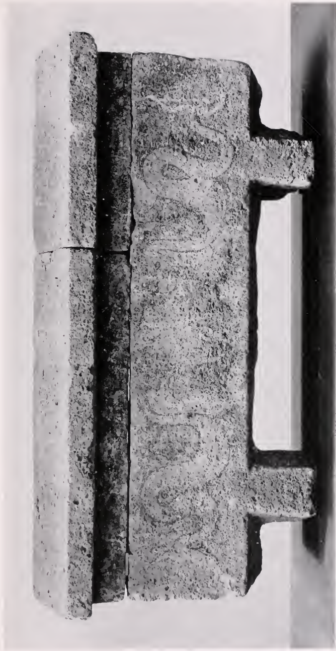
ETRUSCAN SARCOPHAGUS C (SIDE OPPOSITE THE ONE IN PRECEDING PLATE).