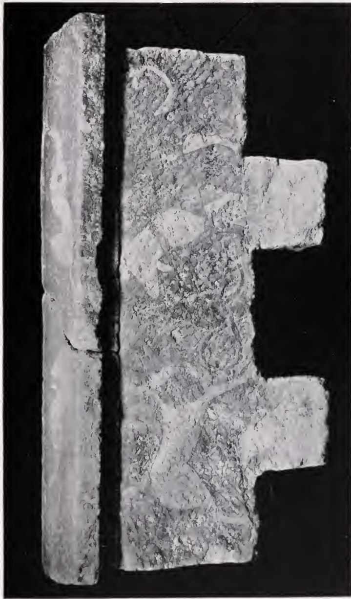
ETRUSCAN SARCOPHAGUS B (SIDE OPPOSITE THE ONE IN PRECEDING PLATE).