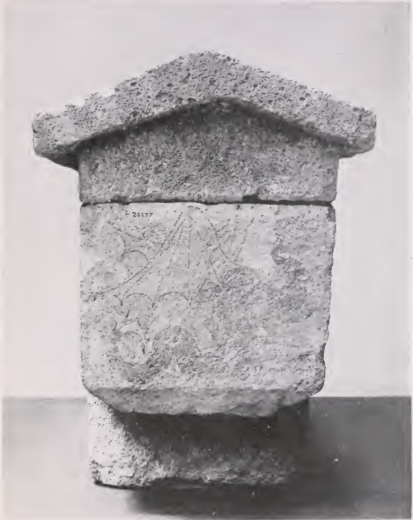
END OF ETRUSCAN SARCOPHAGUS C.