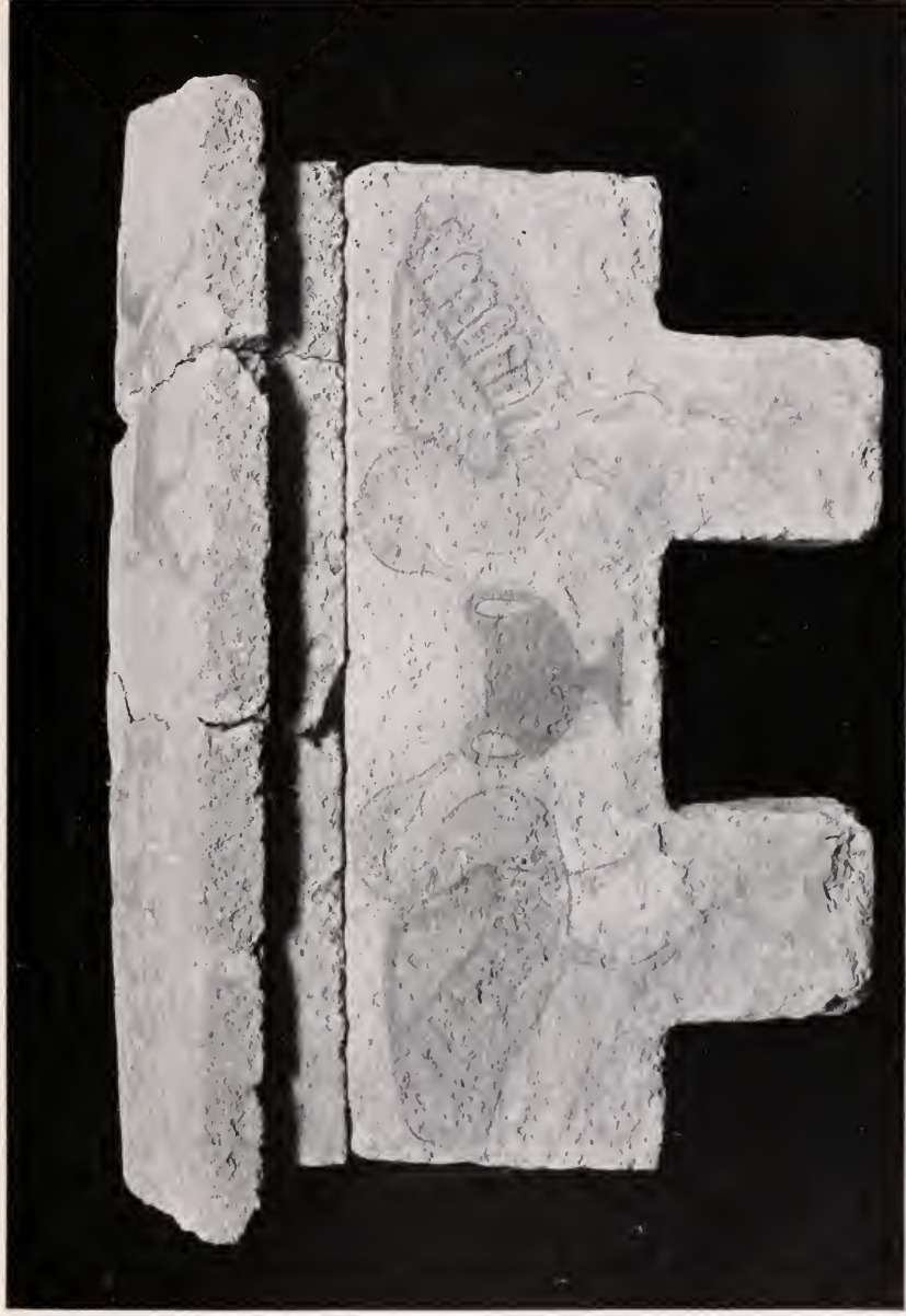
ETRUSCAN SARCOPHAGUS A.