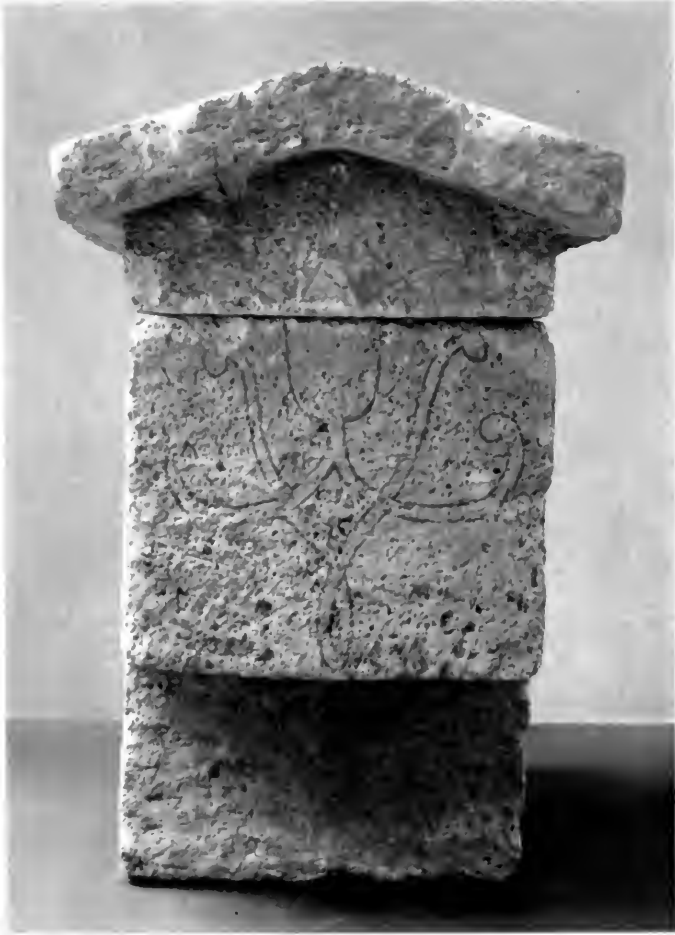
END OF SARCOPHAGUS A.