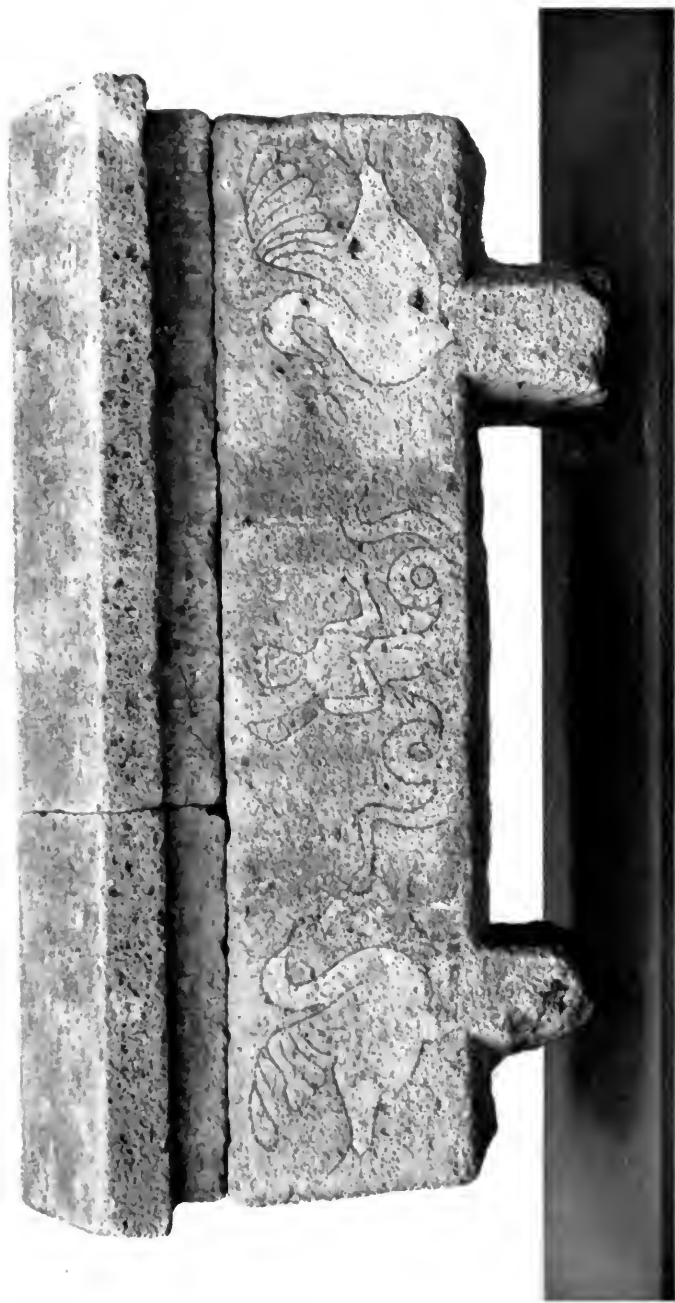
ETRUSCAN SARCOPHAGUS C.