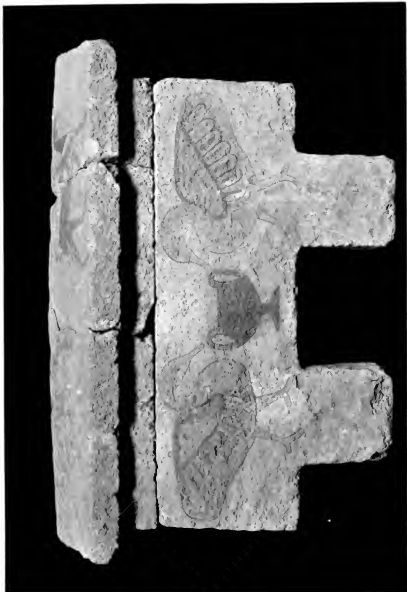
ETRUSCAN SARCOPHAGUS A.