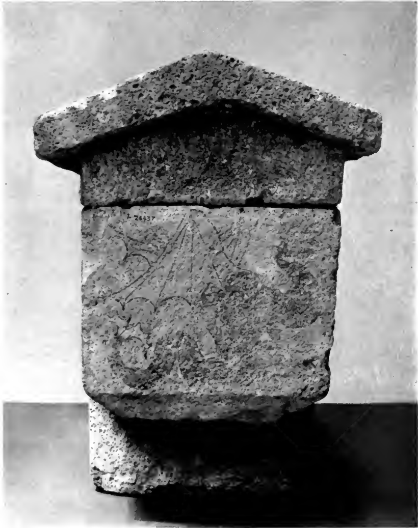
END OF ETRUSCAN SARCOPHAGUS C.