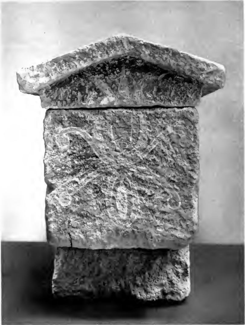
END OF SARCOPHAGUS B (OPPOSITE THE ONE IN PRECEDING PLATE).