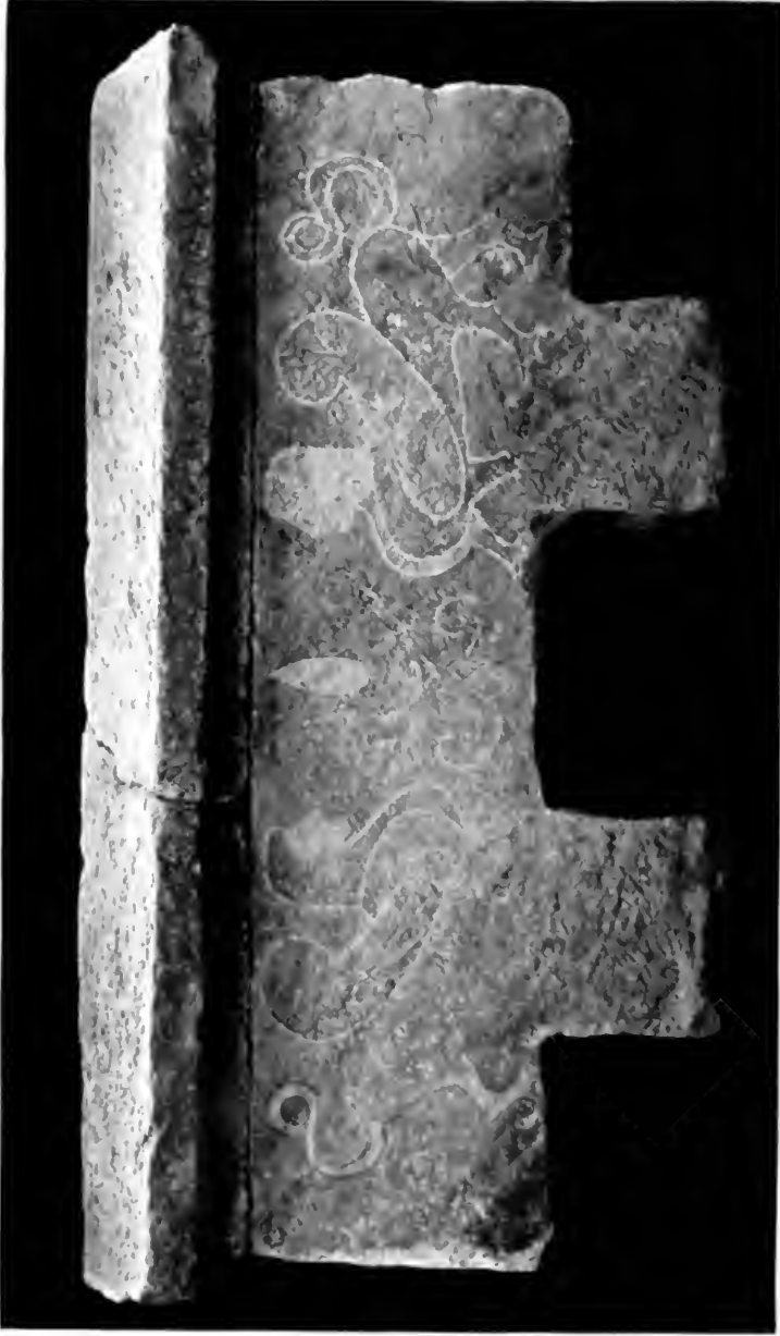
ETRUSCAN SARCOPHAGUS B.