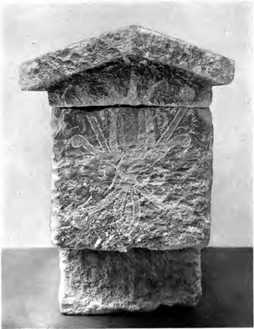
END OF SARCOPHAGUS B.