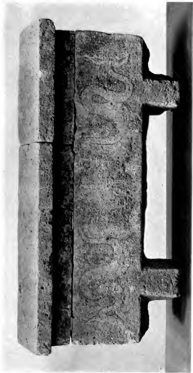
ETRUSCAN SARCOPHAGUS C (SIDE OPPOSITE THE ONE IN PRECEDING PLATE).