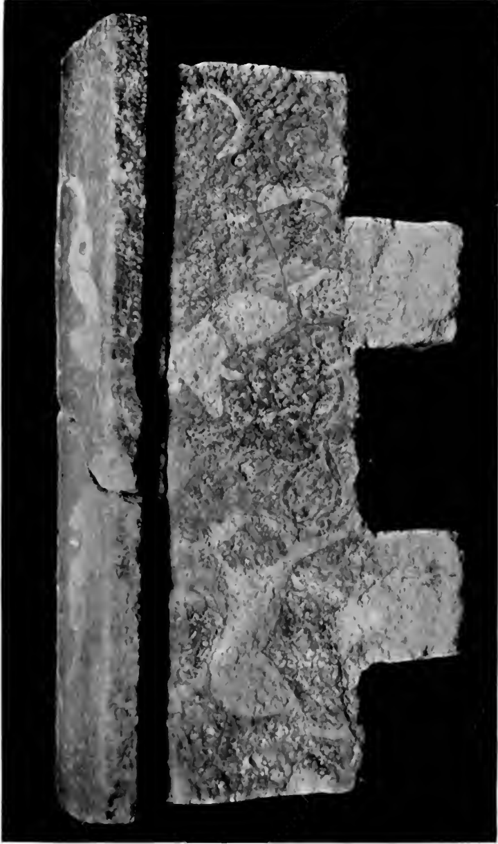
ETRUSCAN SARCOPHAGUS B (SIDE OPPOSITE THE ONE IN PRECEDING PLATE.)