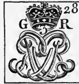
Stamp and Counter-stamp 1765.

after the French and Indian War, the odious Stamp Act was passed, which did much to hasten public opinion toward the Revolution.