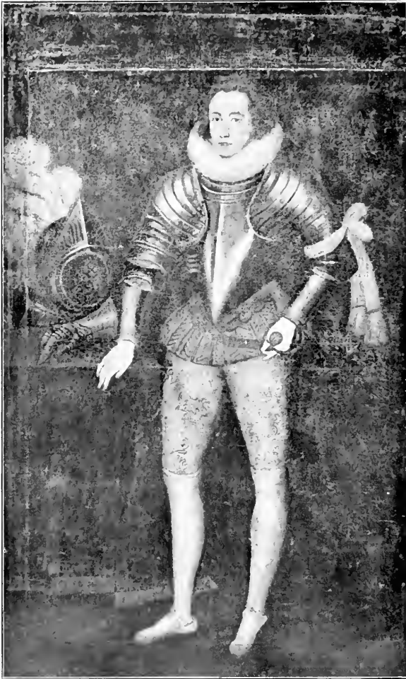
ROGER, SECOND LORD NORTH.