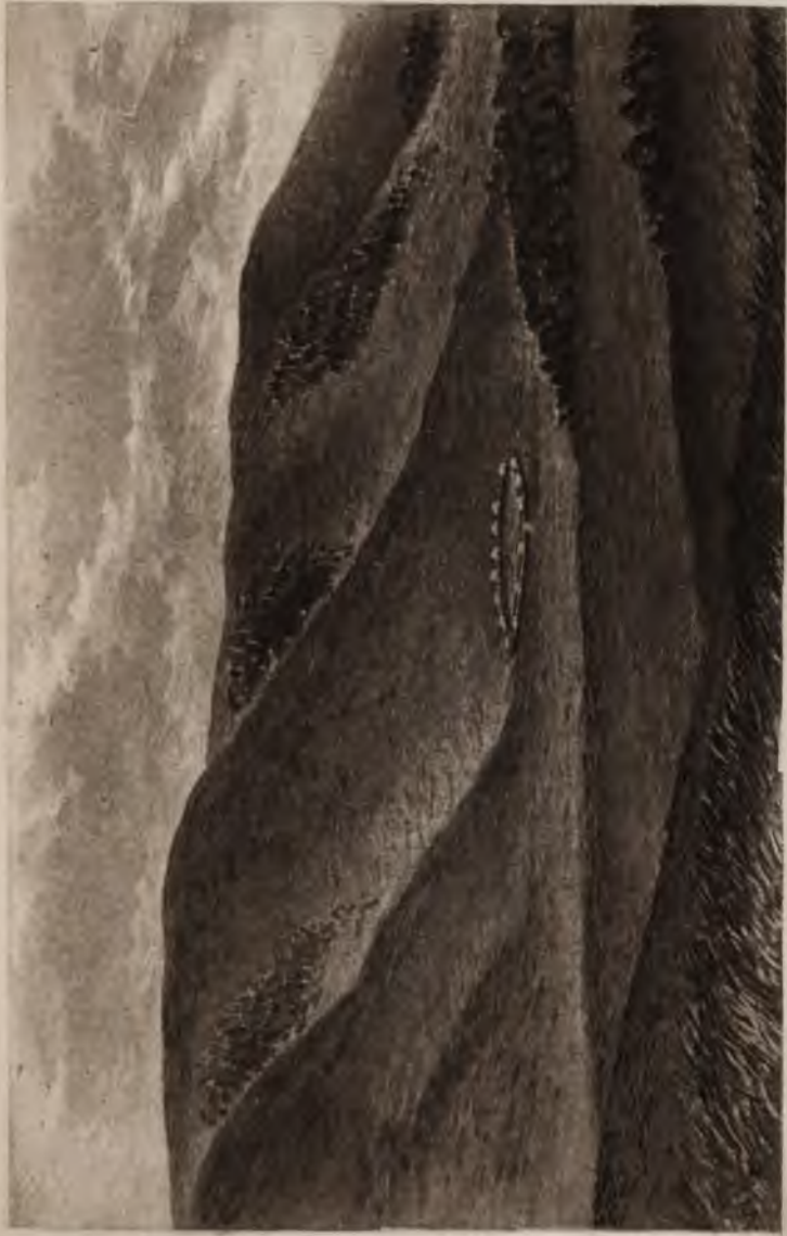
E Z U L W I N I