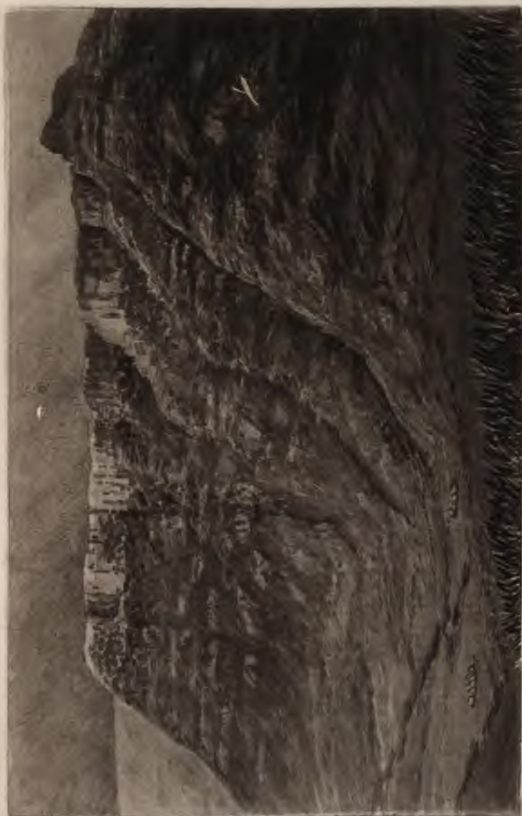
HLOBANE MOUNTAIN WESTERN SIDE