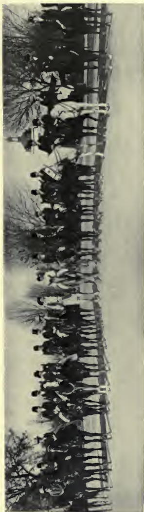
EL. FOX CHASE