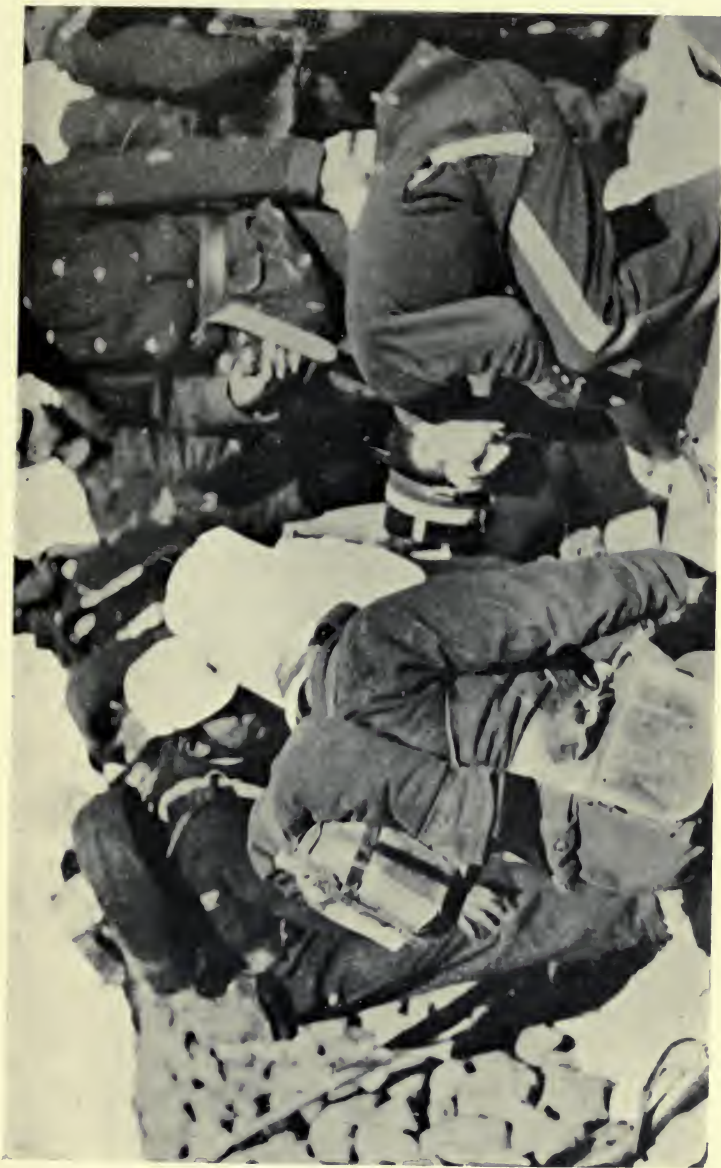
FEDERAL AMBULANCE WORK IN THE FIELD