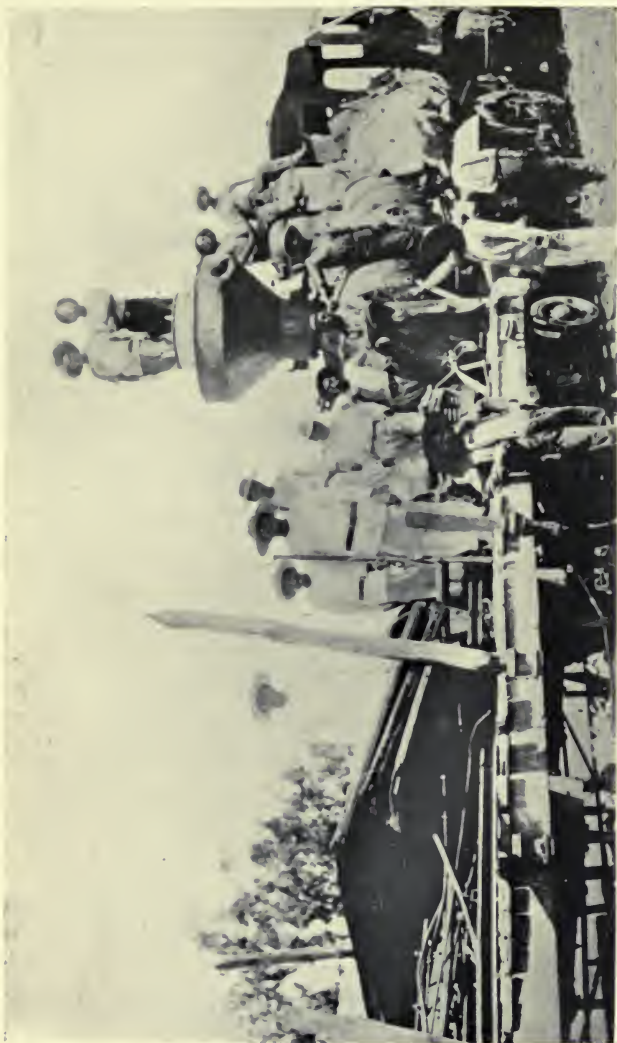
LOCO AND WRECKED FREIGHT CARS IN THE HANDS OF REBELS