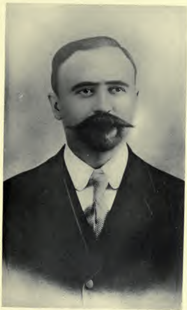
FRANCISCO I. MADERO REBEL LEADER, LATE PRESIDENT OF MEXICO