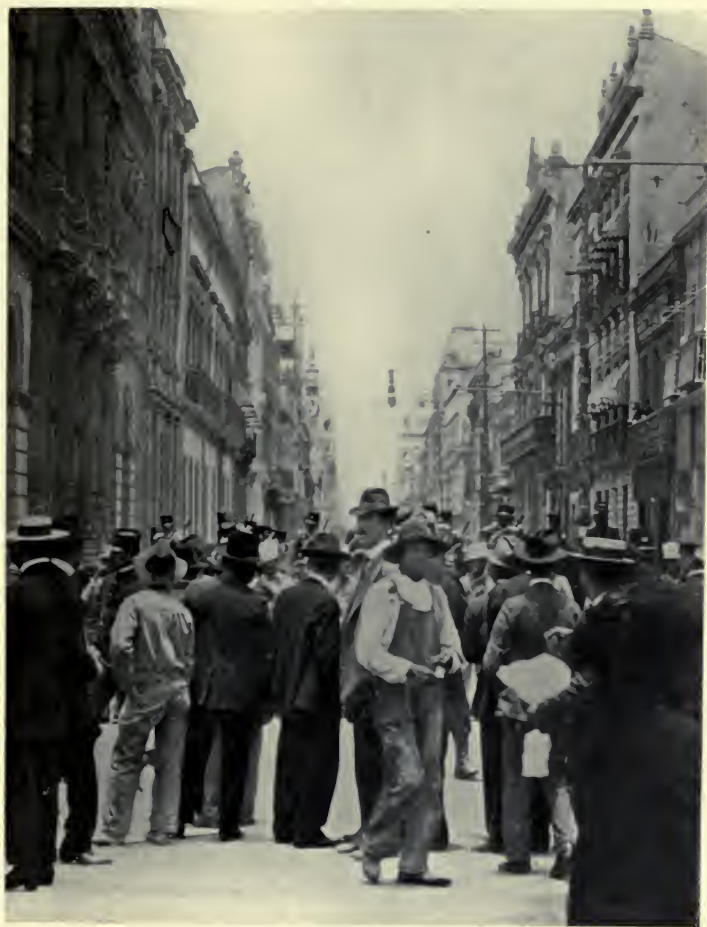
TROOPS GUARDING PRESIDENT DIAZ'S HOUSE IN CALLE CADENA