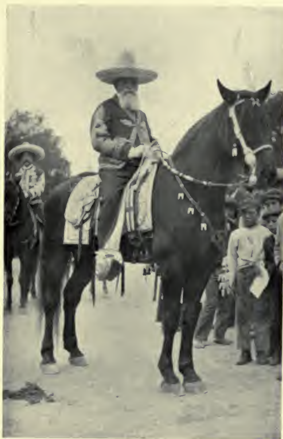
A COLONEL OF RURALES