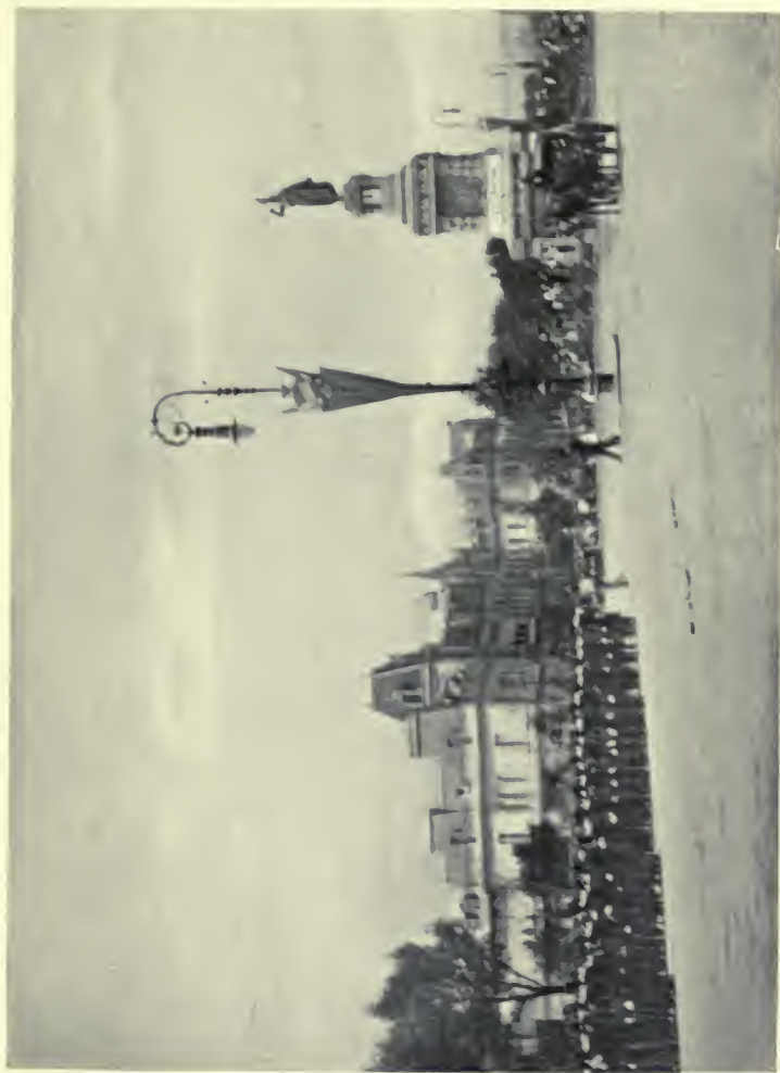
TROOPS MUSTERED ON THE PASEO DE LA REFORMA