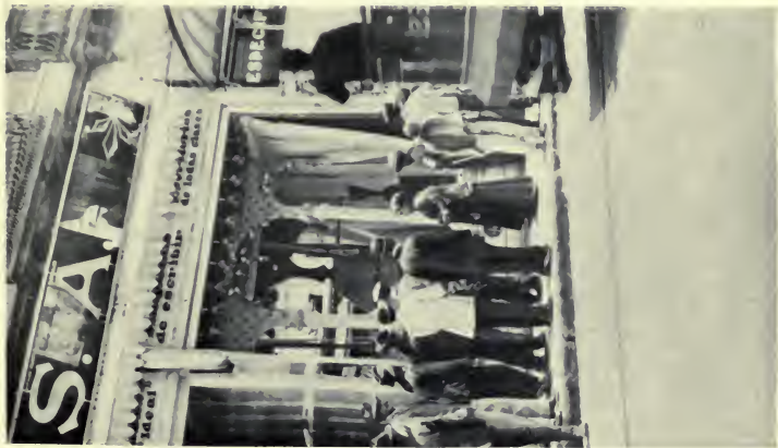
SHOPS DESTROYED BY RIOTERS, MAY 24TH MEXICO CITY