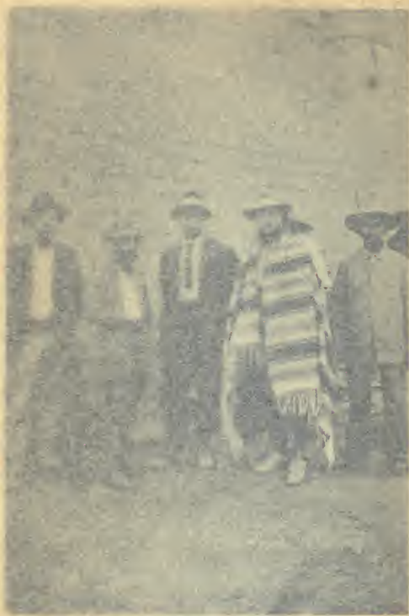
WOMEN AT THE MOUNTAIN