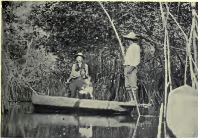
IN THE LAGOONS, A NATIVE CANOE