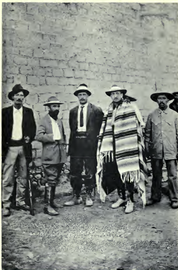
MADERO AND HIS EXECUTIVE