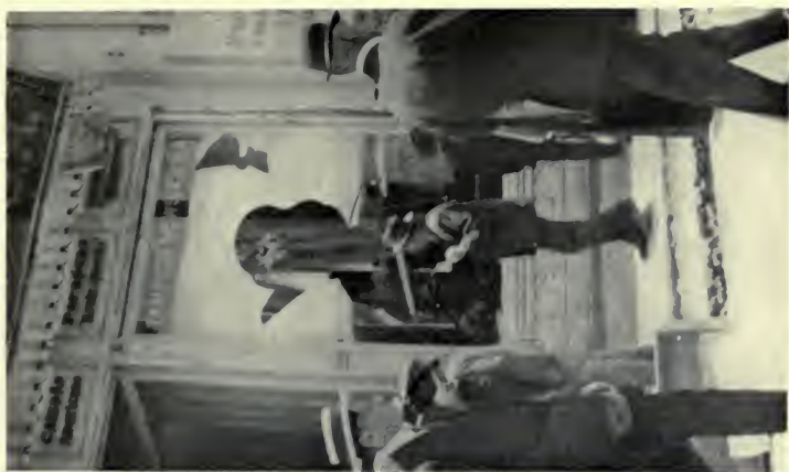
WRECKED FOREIGNERS SHOPS