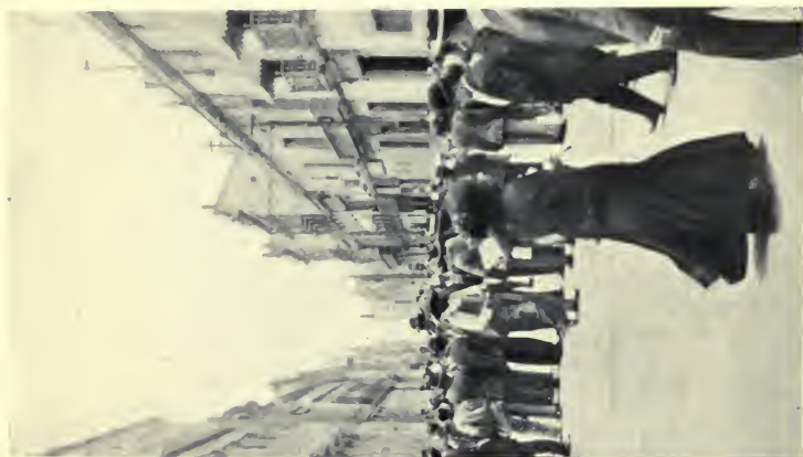
THE GUARD ON DUTY OUTSIDE PRESIDENT DIAZ'S HOUSE, CLOSING BOTH ENDS OF THE STREET