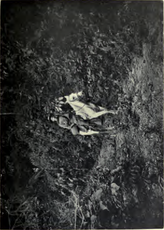
THE MOUNTAIN TRAIL