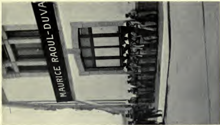
MEXICAN FEDERAL SOLDIERS GUARDING FOREIGNERS PROPERTY