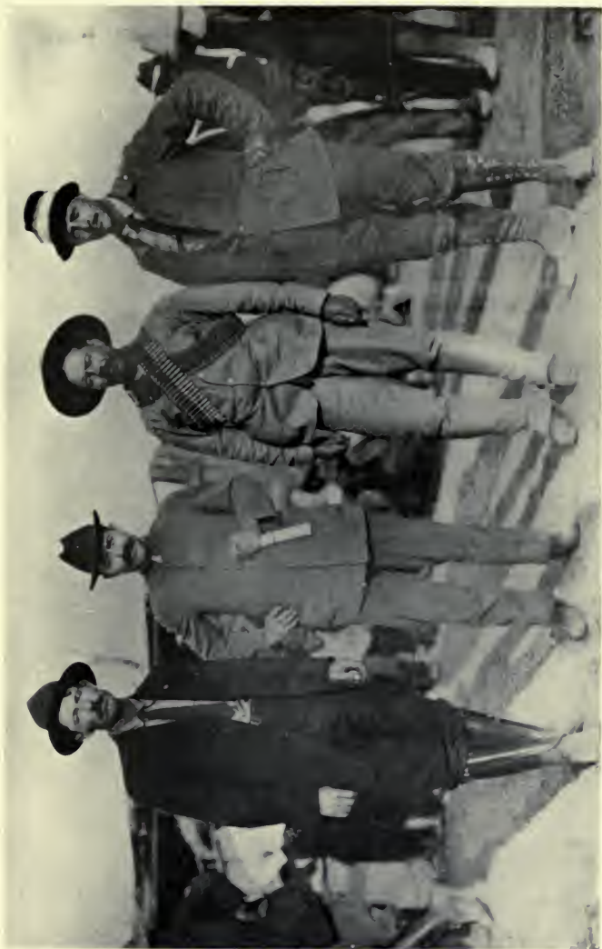
REVOLUTIONARY LEADERS IN CHIHUAHUA