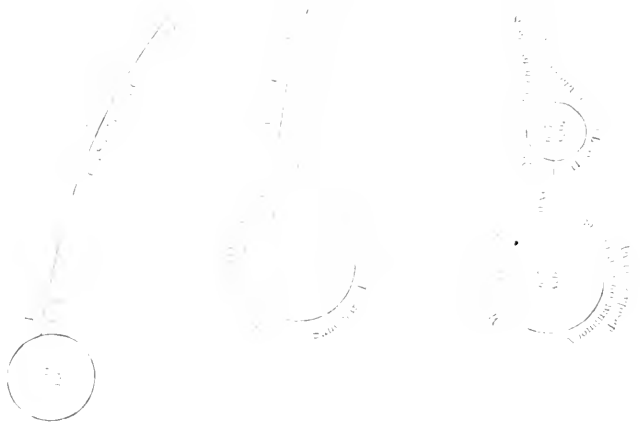
Diagram of the Earth and Moon referred to in this paper