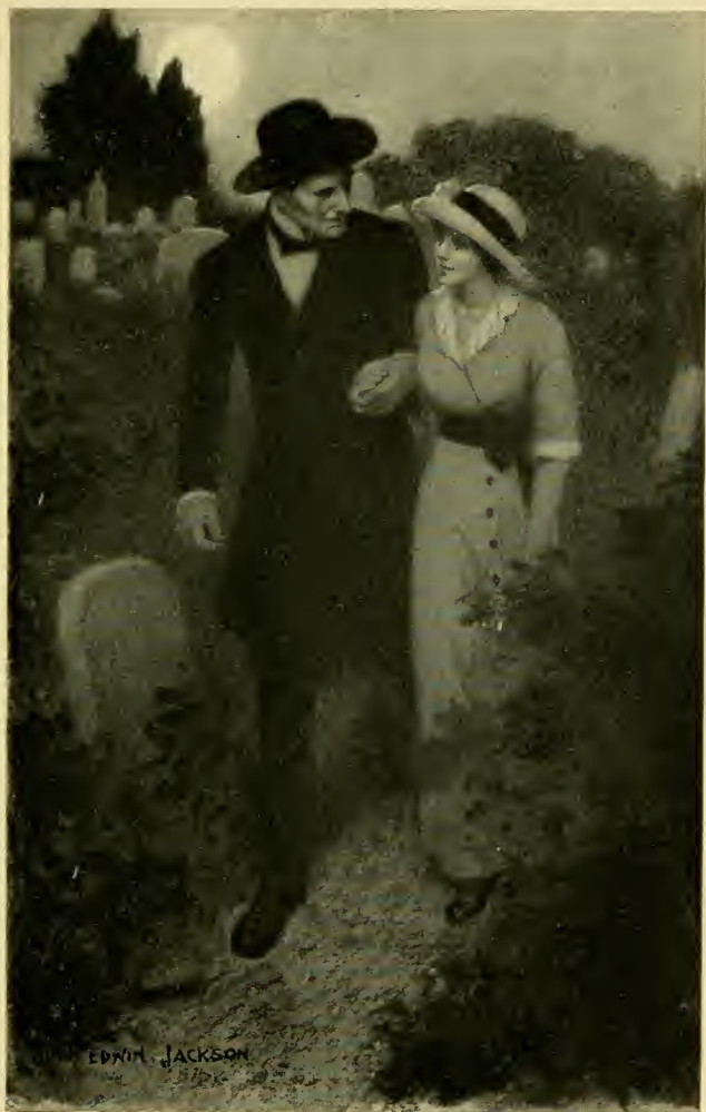
Scrouged so close to his arm that it was difficult for both of them to walk