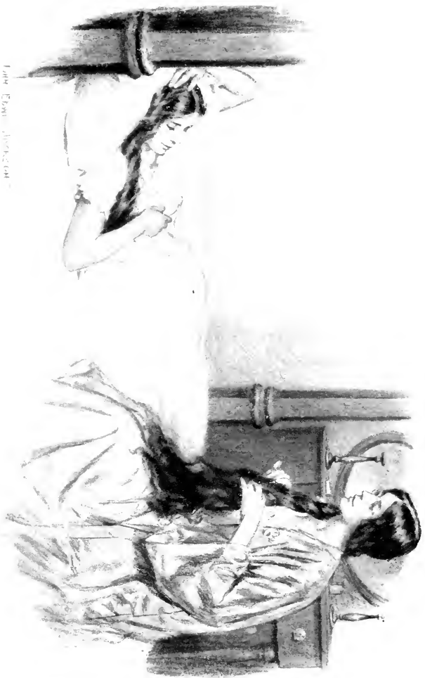
From "The League"

"We must not allow the men time to get sore over this matter of the League"