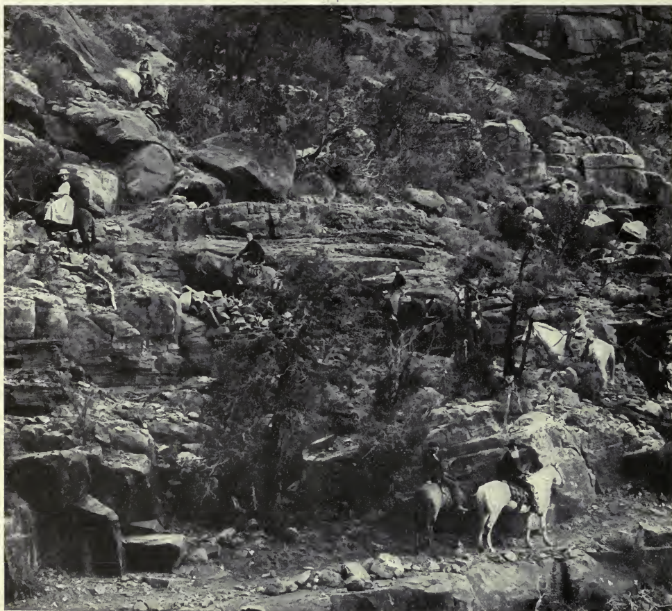
A Party on Bright Angel Trail.

The last considerable drop is a 40-foot bit by the side of a pretty cascade, where there are just enough irregularities in the wall to give toe-hold. The narrowed cleft becomes exceedingly wayward in its course, turning abruptly to right and left, and working down into twilight depth. It is very still. At every turn one looks to see the embouchure upon the river, anticipating the sudden shock of the unintercepted roar of waters. When at last this is reached, over a final downward clamber, the traveler stands upon a sandy rift confronted by nearly vertical walls many hundred feet high, at whose base a black torrent pitches in a giddy upward slide that gives him momentarily the sensation of slipping into an abyss.