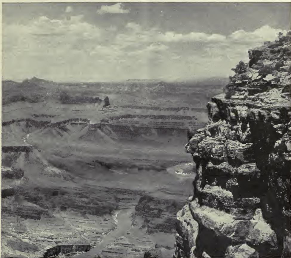
Bissell Point and Colorado River.