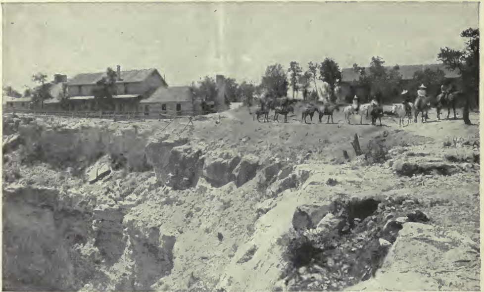
Bright Angel Hotel.

The round-trip ticket rate, Williams to Grand Canyon and return, is only $6.50. Adding $6 for two days' stay at Canyon Hotel, $1 for part of a day at hotel in Williams, $1.50 for probable proportion of cost of guide, $3 for trail stock, and the total necessary expense of the three days' stop-over is about $18 for one person; each additional day only adds $3 to the cost for hotel.