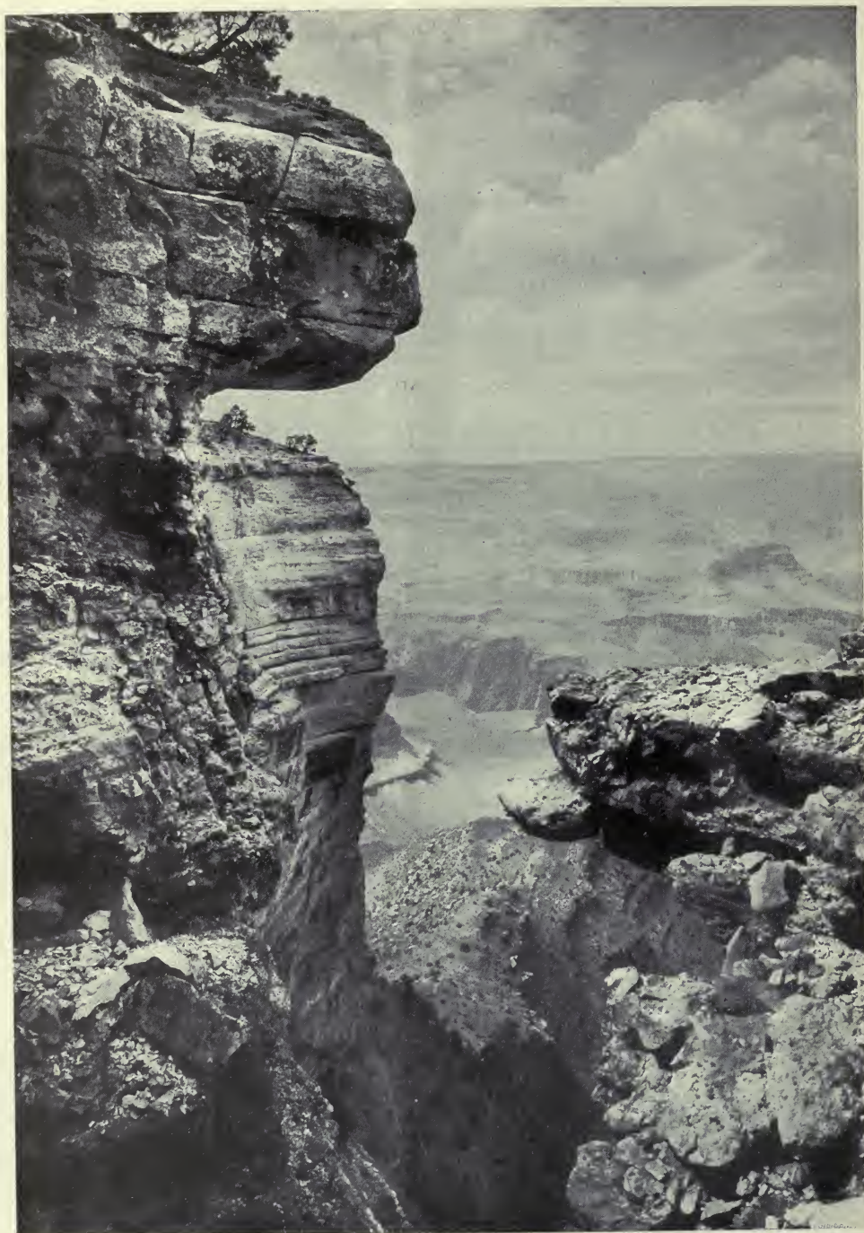
From Kaibab Plateau, Looking South.