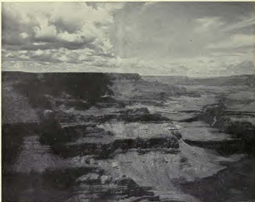
The River and the Canyon Wall.