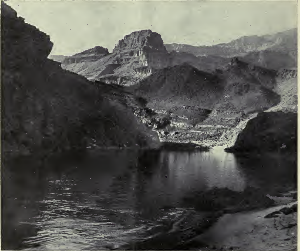
The Colorado, Foot of Bright Angel Trail.

In 1869 Maj. J. W. Powell undertook the exploration of the river with nine men and four boats, starting from Green River City, on the Green River, in Utah. The project met with the most urgent remonstrance from those who