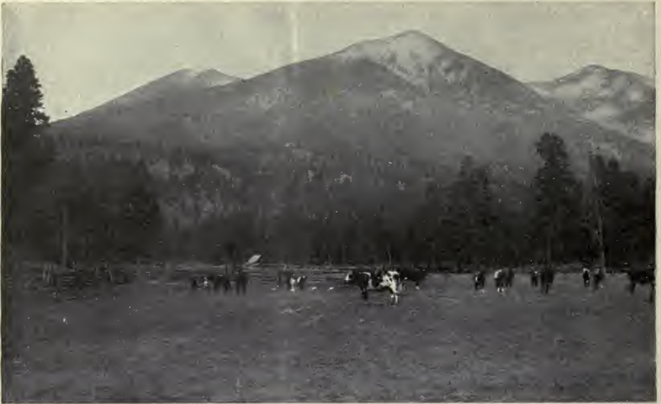
San Francisco Peaks.

were of the same stock as the Pueblo Indians of to-day and that they lived here about 800 years ago.