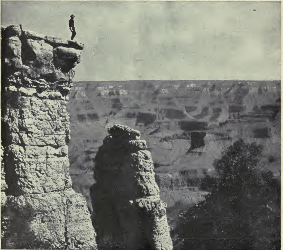
On Grand View Point.

You can not see the Grand Canyon in one view as if it were a changeless spectacle from which a curtain might be lifted, but to see it you have to toil from month to month through its labyrinths. It is a region more difficult to traverse than the Alps or the Himalayas, but if strength and courage are sufficient for the task, by a year's toil a concept of sublimity can be obtained never again to be equaled on the hither side of paradise.