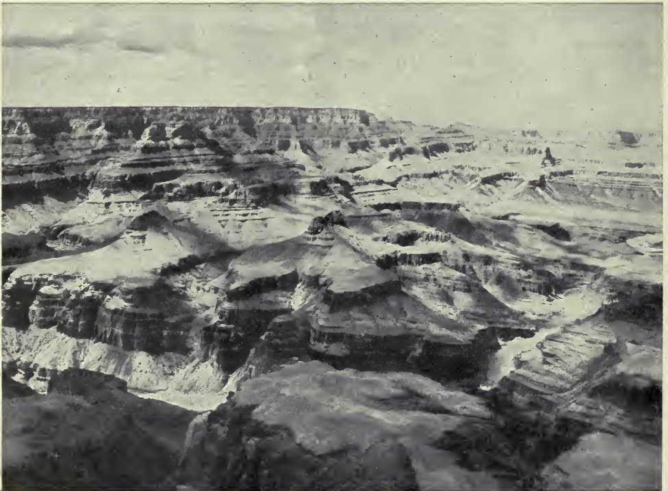
A Panoramic View of the Canyon.

These are the elements with which the walls are constructed, from black buttress below to alabaster tower above. All of these elements weather in different forms and are painted in different colors, so that the wall presents a highly complex façade. A wall of homogeneous granite, like that in the Yosemite, is but a naked wall, whether it be 1,000 or 5,000 feet high. Hundreds and thousands of feet mean nothing to the eye when they stand in a meaningless front. A mountain covered by pure snow 10,000 feet high has but little more effect on the imagination than a mountain of snow 1,000 feet high—it is but more of the same thing—but a façade of seven systems of rock has its sublimity multiplied sevenfold.