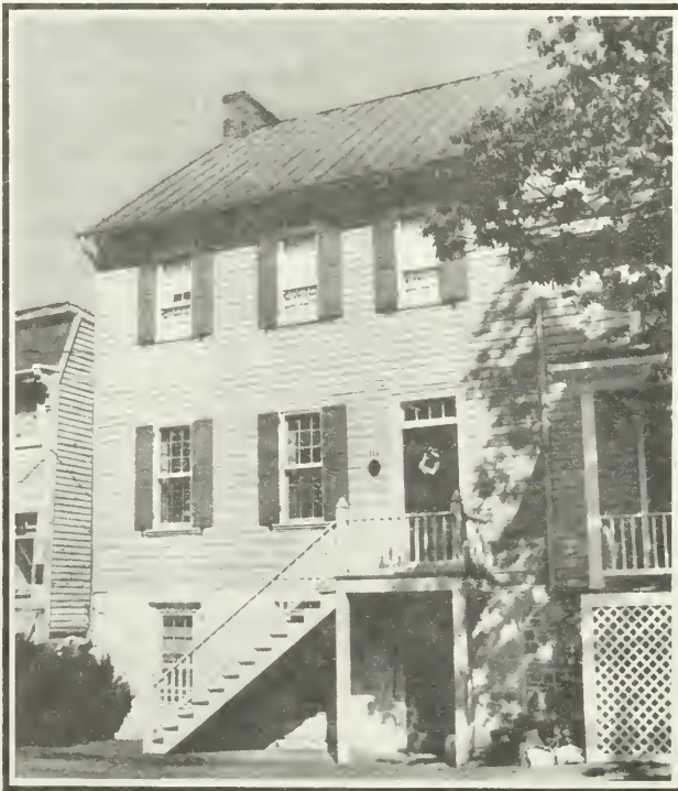
Baldwin Home - Winchester, Virginia