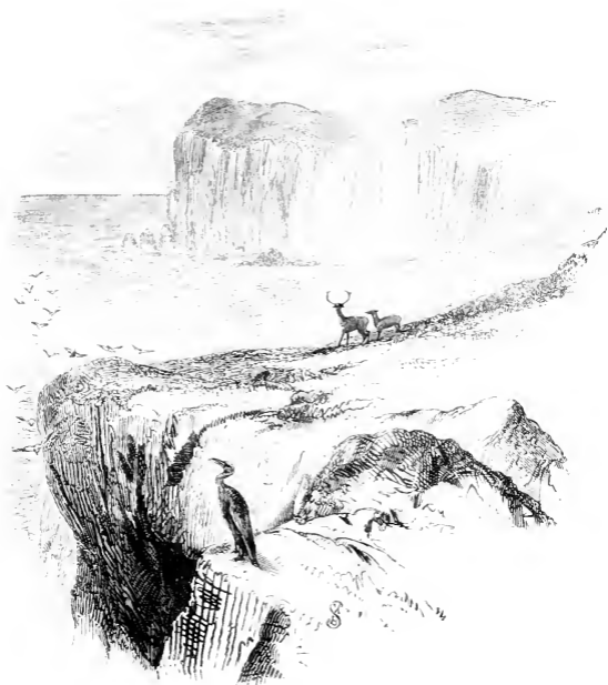
View of Whiten Head