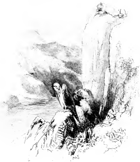
11. Near Rhenmen.