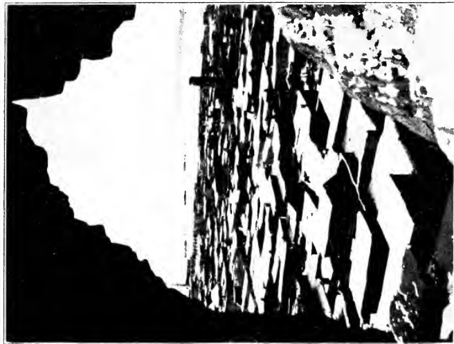
Van—from the citadel