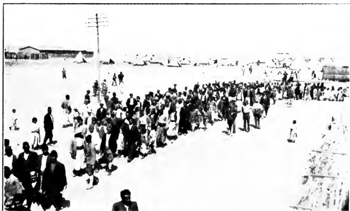
Life in an Armenian refugee camp—Port Said