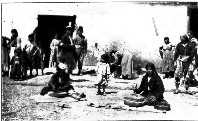
Home life in an Armenian village