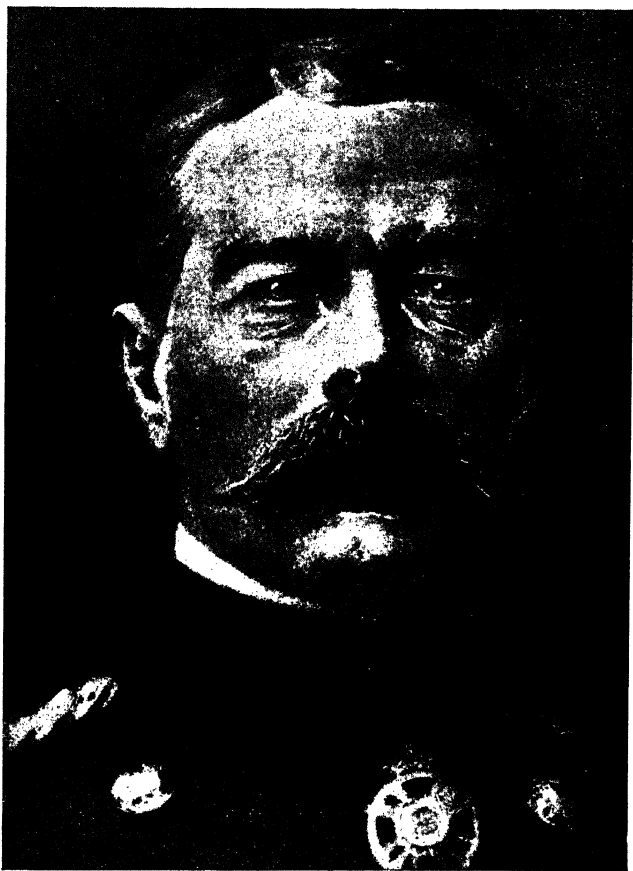
LORD K., 1916

From a sketch by Jean Baptiste Guth, by kind permission of "The Graphic."