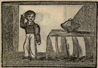
L Longed for it