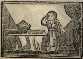
M Mourned for it