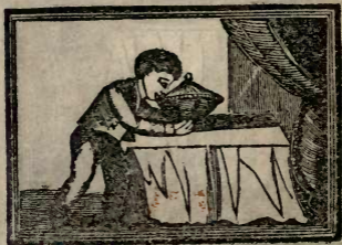
B Bit it.