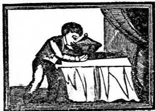
B Bit it.