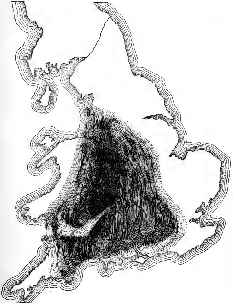
SUPPOSED AREA OF THE EARTHQUAKE (JUDGING FROM THE LETTERS SENT TO "THE TIMES"). THE VERY DARK PORTION REPRESENTS THE POINTS OF GREATEST INTENSITY IN THE SHOCK.