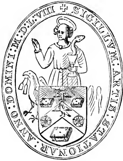
A FACSIMILE OF THE ORIGINAL SEAL OF THE COMPANY FROM THE TRICKING IN THE COLLEGE OF ARMS, LONDON.