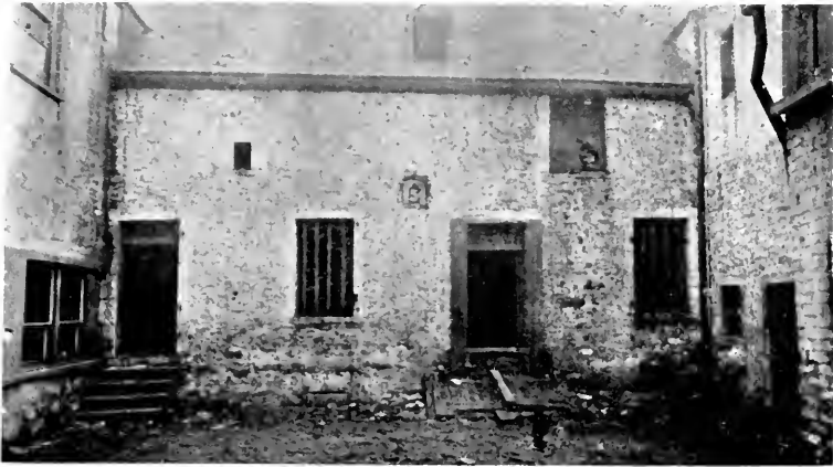
Interior and South Exterior of the Warehouse on St. Paul Street, Montreal, occupied by Alexander Henry in 1780.