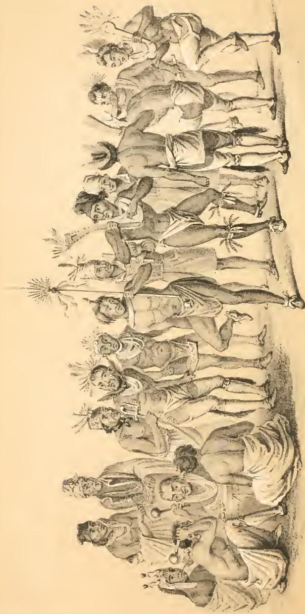
WARDANCE OF THE SAKS AND FOXES.