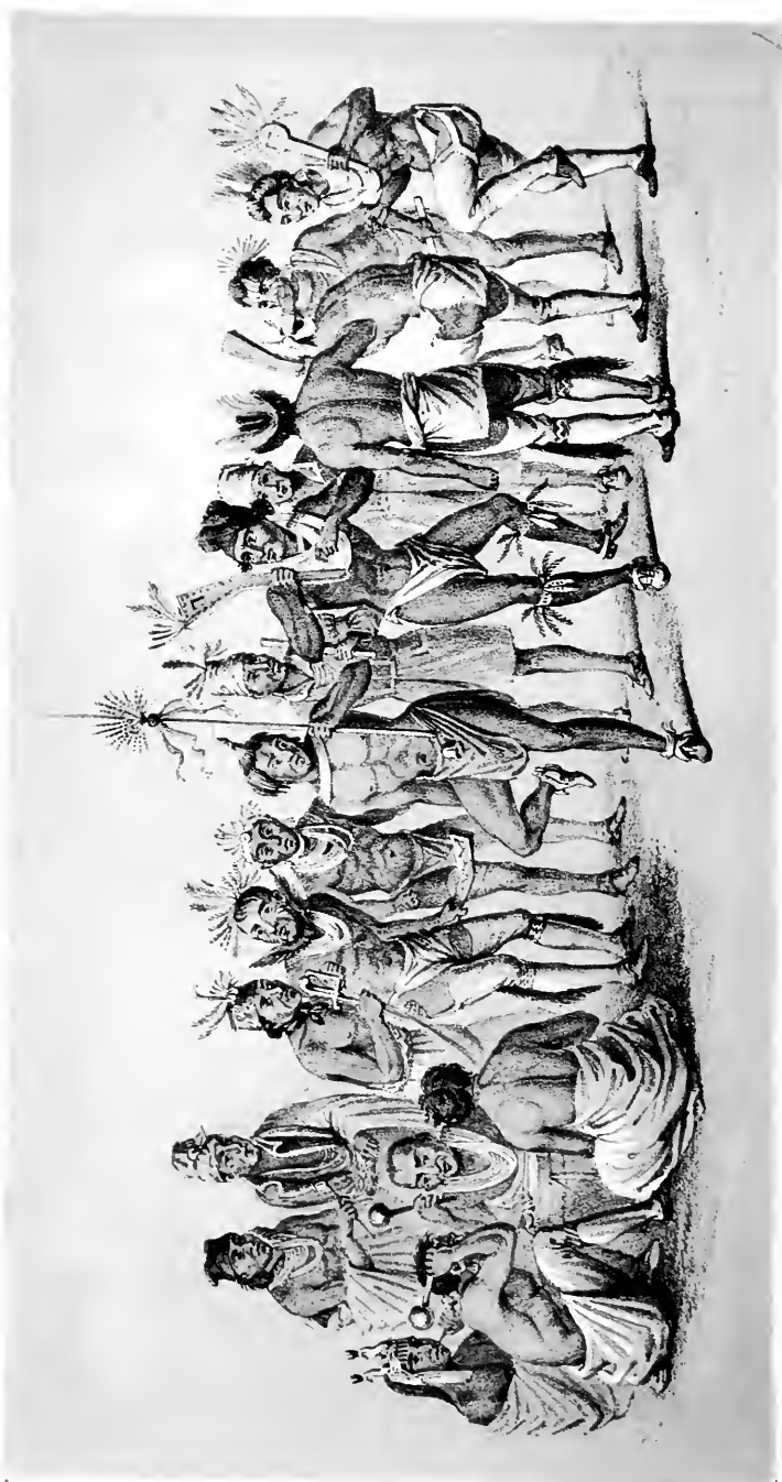
WARDANCE OF THE SAKS AND FOXES.