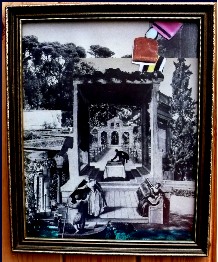
"Polite Vortex" – One book, wrapping paper, marker pen