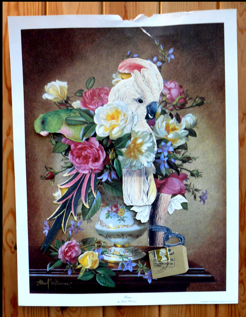
"What Edward Found" – Three prints, marker pen, parcel tape, sellotape, envelope, postage stamp