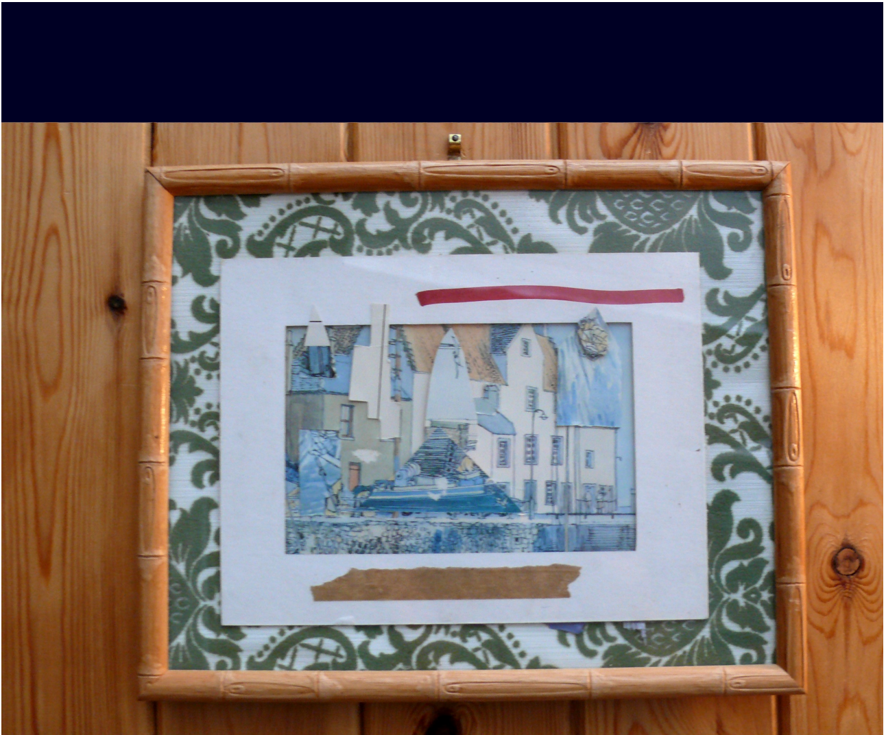
"Starboard Cathedral" – Two prints, marker pen, brown paper, wallpaper, gaffer tape