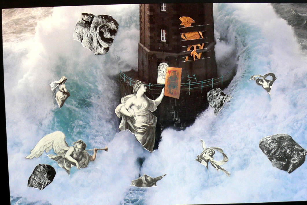
"The Belfry" – Three books, a playing card, and a print.