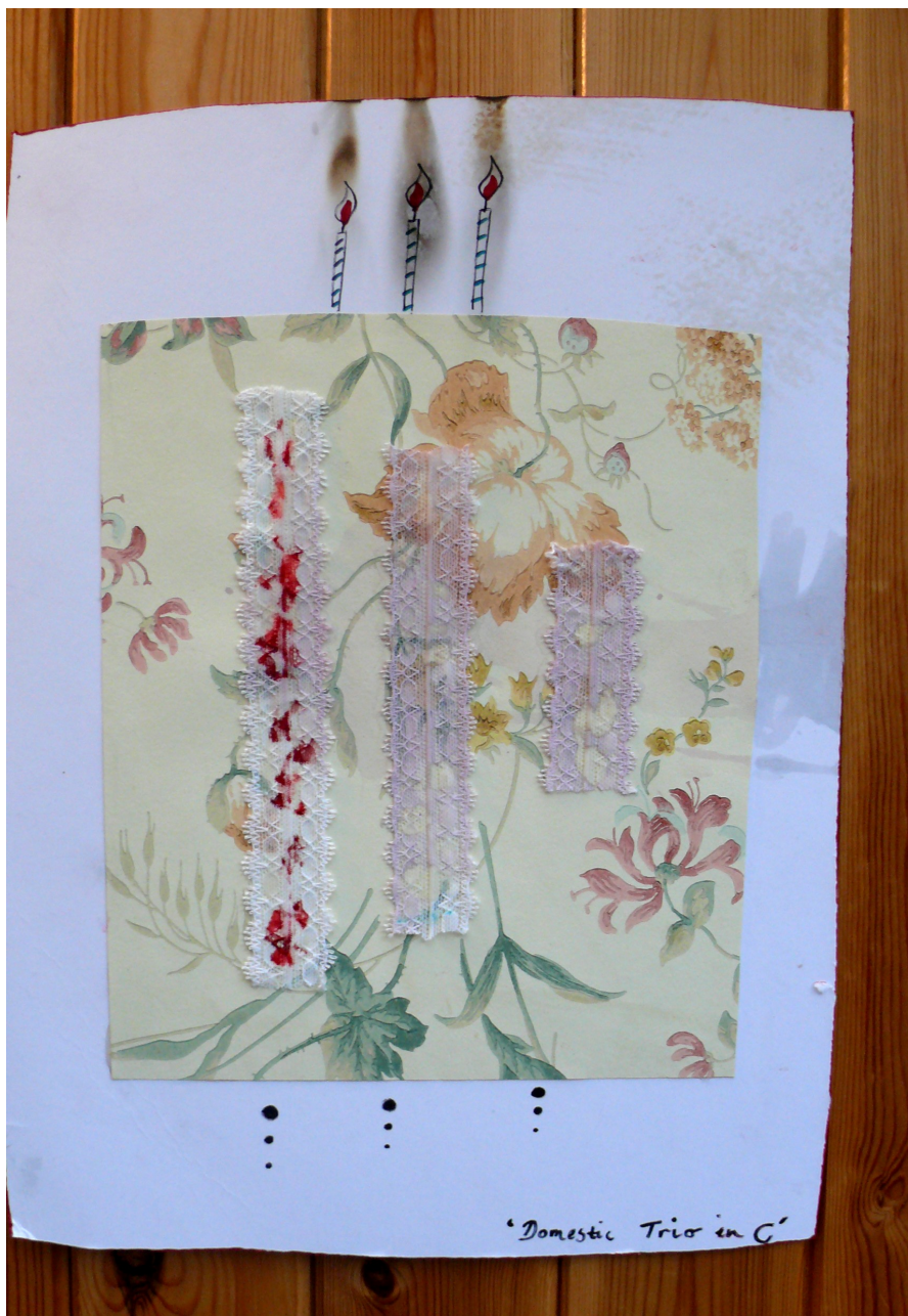
"Domestic Trio in C" – Wallpaper, ribbon, marker pen, fire, card