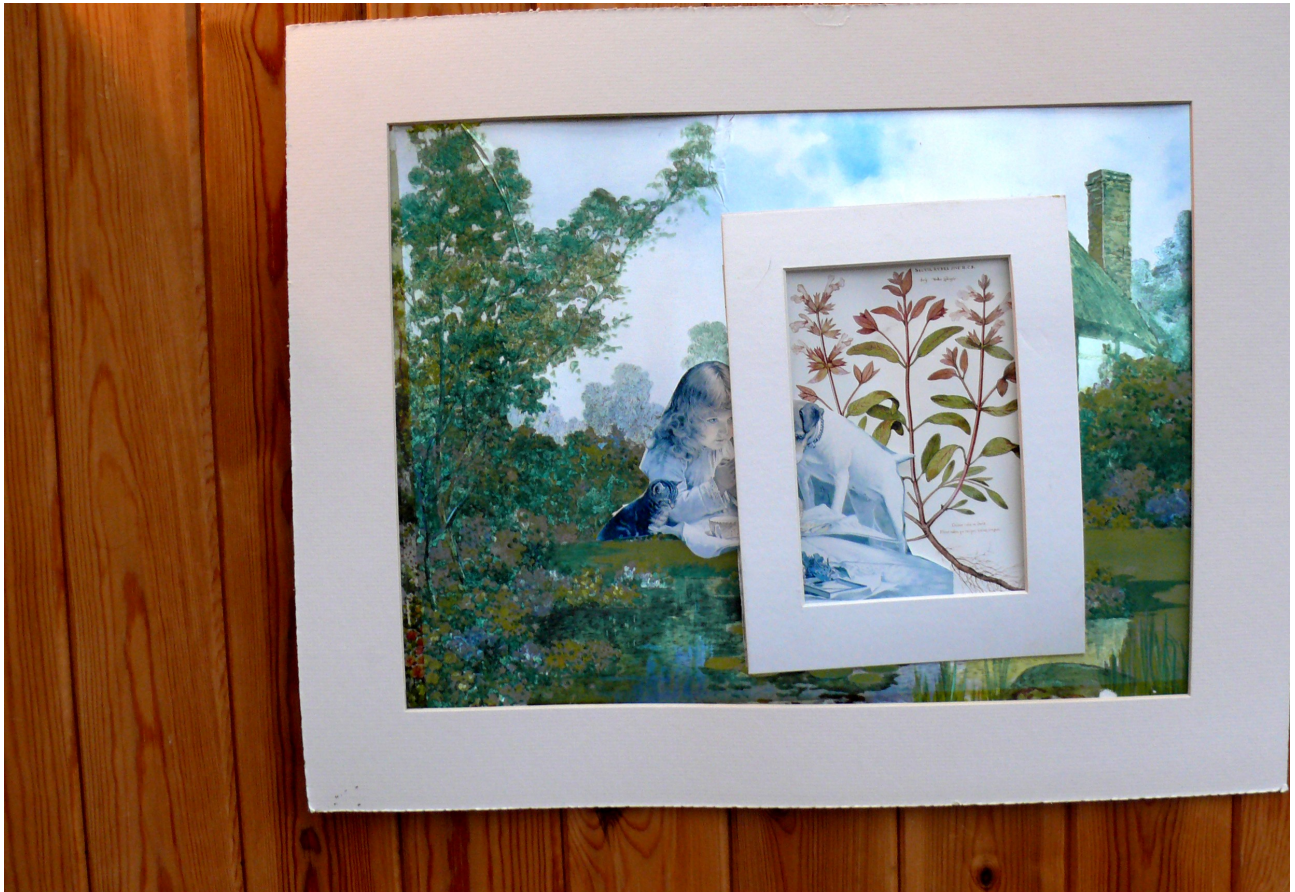
"The Waving" – Three prints and parcel tape