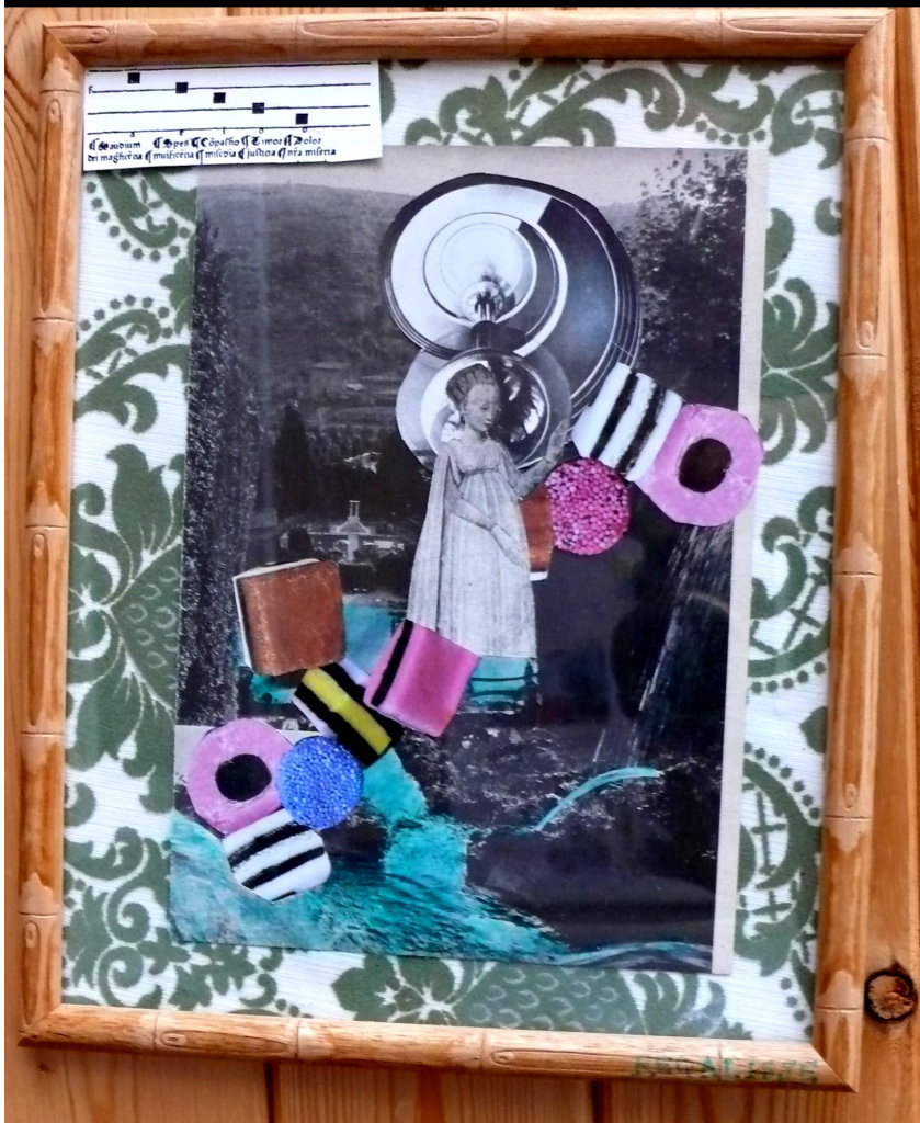
"The River Fills" – Wrapping paper, two prints, wallpaper, one book, marker pen