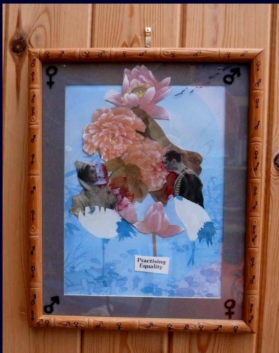
“Practising Equality” – Sheet music cover, two prints, advertising, marker pen