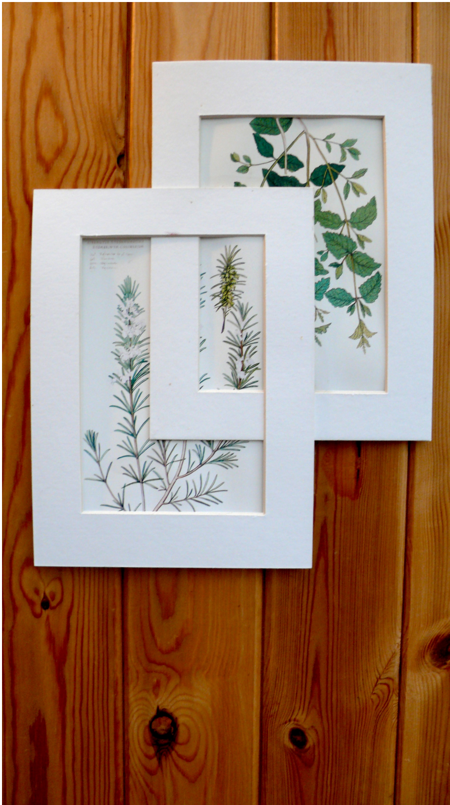
“Georgette” – Two botanical prints and sellotape