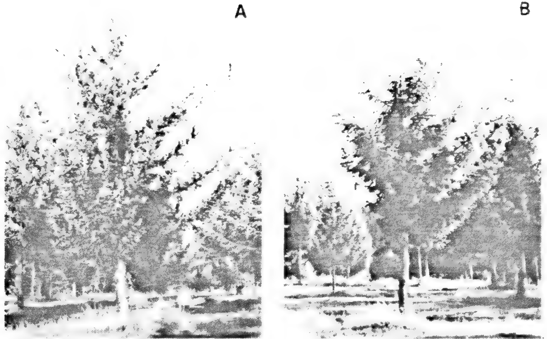
Figure 2.—Top breakage in seed orchard trees 7-9 meters tall: A , acceptable amount (confined within the top three whorls); B , unacceptable amount (4 whorls or more).