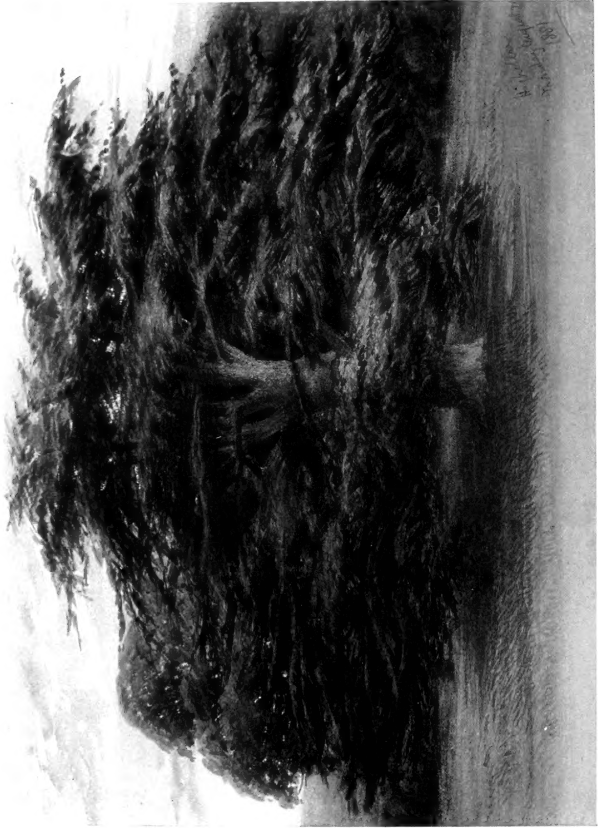
LEBANON CEDAR AT HIGHCLERE CASTLE