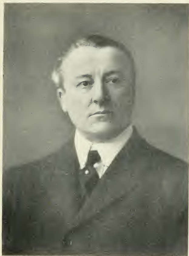
Mr. E. Marshall Hall, K.C.