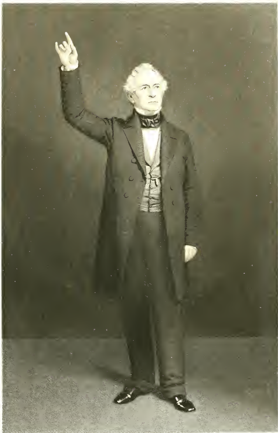
ROGER TANEY A FULL-LENGTH PORTRAIT OF TANEY DELIVERING HIS OPINION IN WASHINGTON

THE NATIONAL ARCHIVES COLLEGE PARK, MARYLAND