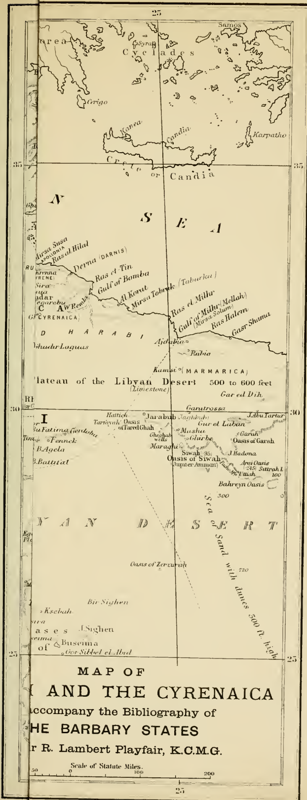
MAP OF THE EASTERN DESERT AND THE CYRENAICA to accompany the Bibliography of THE BARBARY STATES by R. Lambert Playfair, K.C.M.G.