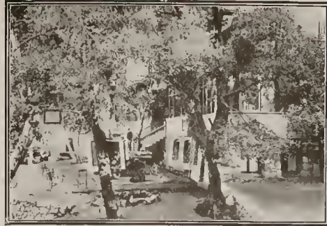
A Glimpse of Ye Alpine Tavern, 5000 feet above the sea.

Through cars from 6th and Main Sts. at 8, 9, 10, a. m. and 1 and 3:30 p. m. Round trip fare $2.50. Special excursions Saturday and Sunday.