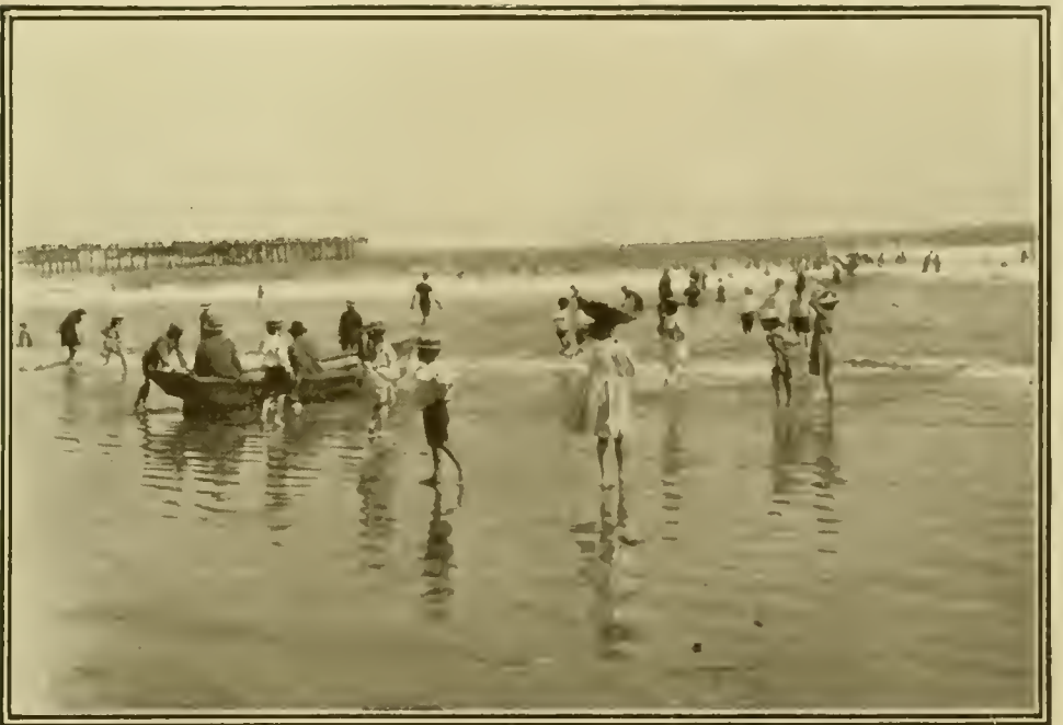
Children on the Sand at Long Beach.