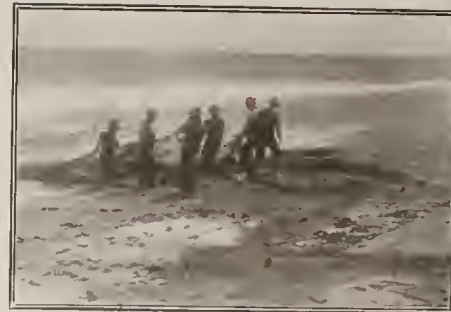
Drawing the Net at Huntington Beach