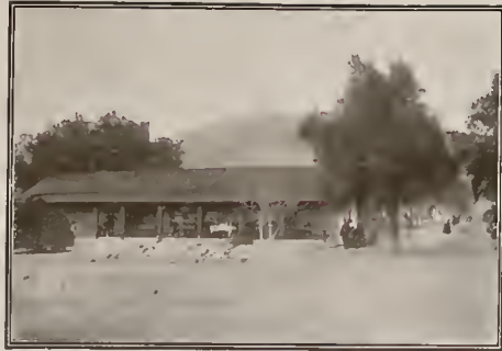
The Old Adobe Restaurant, Casa Verdugo