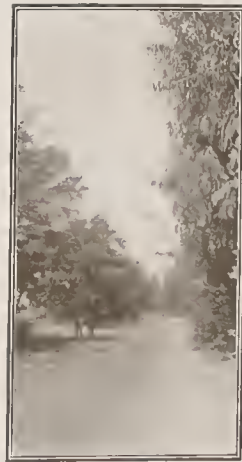
A Country Road Near Monrovia