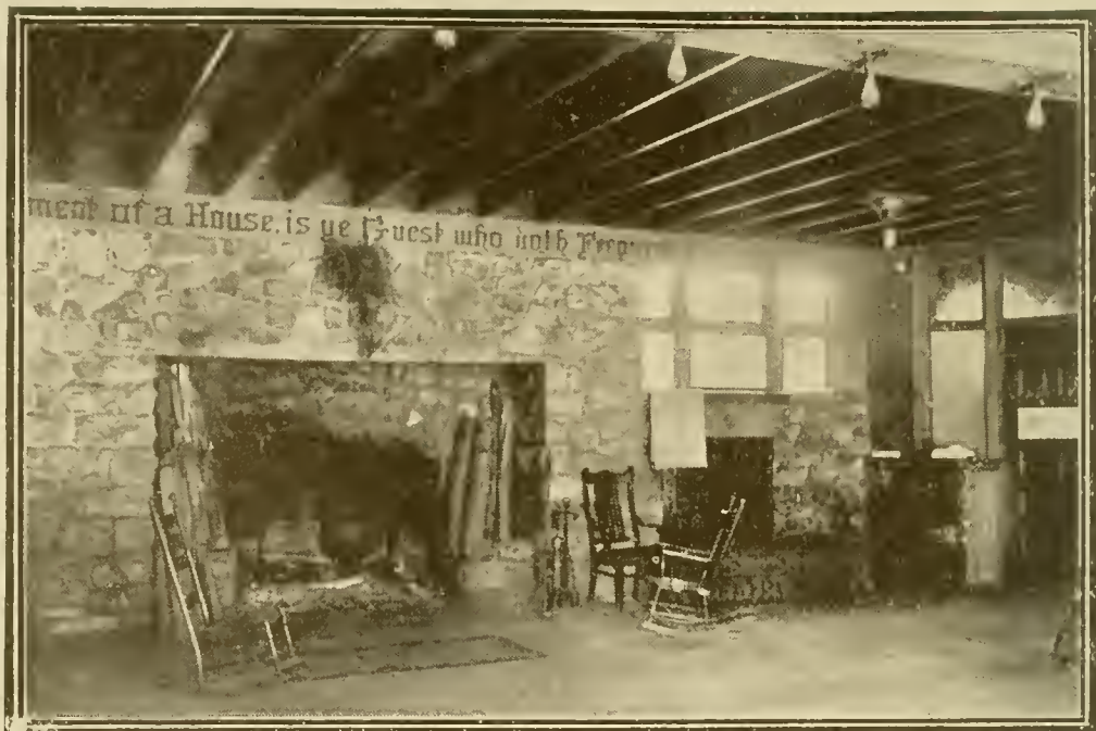
The Hospitable Fire Place at Alpine Tavern