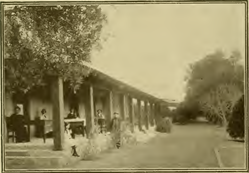
Eating "Hot Stuff" on the Broad, Cool Veranda, Casa Verdugo.

A DOUBLE daily parlor observation car service is maintained to North Glendale and the historic old home of the Verdugos, now converted into a typical Spanish restaurant. Car leaves Sixth and Main at 9:30 A. M. and 3 P. M. and the fare of $1.00 includes full Spanish dinner at Casa Verdugo. Tally-ho meets each car and for 50 cents extra the passenger is taken on a charming ride through the valley to Brand's Caynon. The whole trip is picturesque and beautiful.