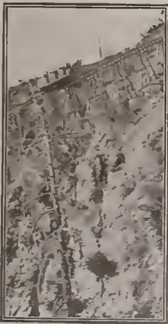
The Great Incline—Mt. Lowe

The Most Marvelous Mountain Railway Journey in the World