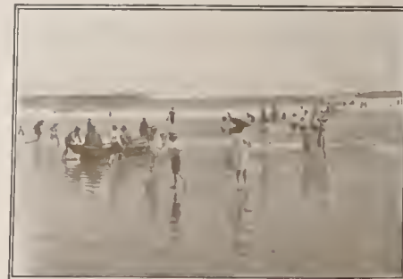
Children on the Sand at Long Beach