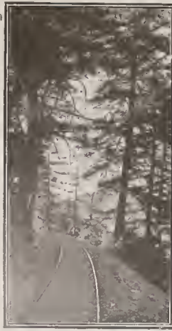
The Track Amid the Pines—Mt. Lowe

A T ye Alpine Tavern, a charming bit of Swiss architecture nestling in a romantic glen and overshadowed by great trees where squirrels frolic and birds sing, begins the trail to the summit. Let us hope the steel rails will never venture farther to rob us of the delights of the burro ride to the apex, only 1100 feet above us, but which winds by the devious path that skirts the highest peaks, where every turn breaks on our vision wide reaching panoramas that inspire and thrill us. From the summit, bald but for a few hardy shrubs and a single pinion pine that somehow found lodgment there, one looks off over thousands of square miles of serrated mountain tops, populous orange and vine clad valleys, and the blue, mysterious island-dotted sea.