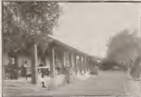
Using "Hot Stuff" on the Brand's Canyon Road, Casa Verdugo.

A DOUBLE daily parlor observation car service is maintained to North Glendale and the historic old home of the Verdugos, now converted into a typical Spanish restaurant. Car leaves Sixth and Main at 9:30 A. M. and 3 P. M. and the fare of $1.00 includes full Spanish dinner at Casa Verdugo. Tally-ho meets each car and for 50 cents extra the passenger is taken on a charming ride through the valley to Brand's Canyon. The whole trip is picturesque and beautiful.