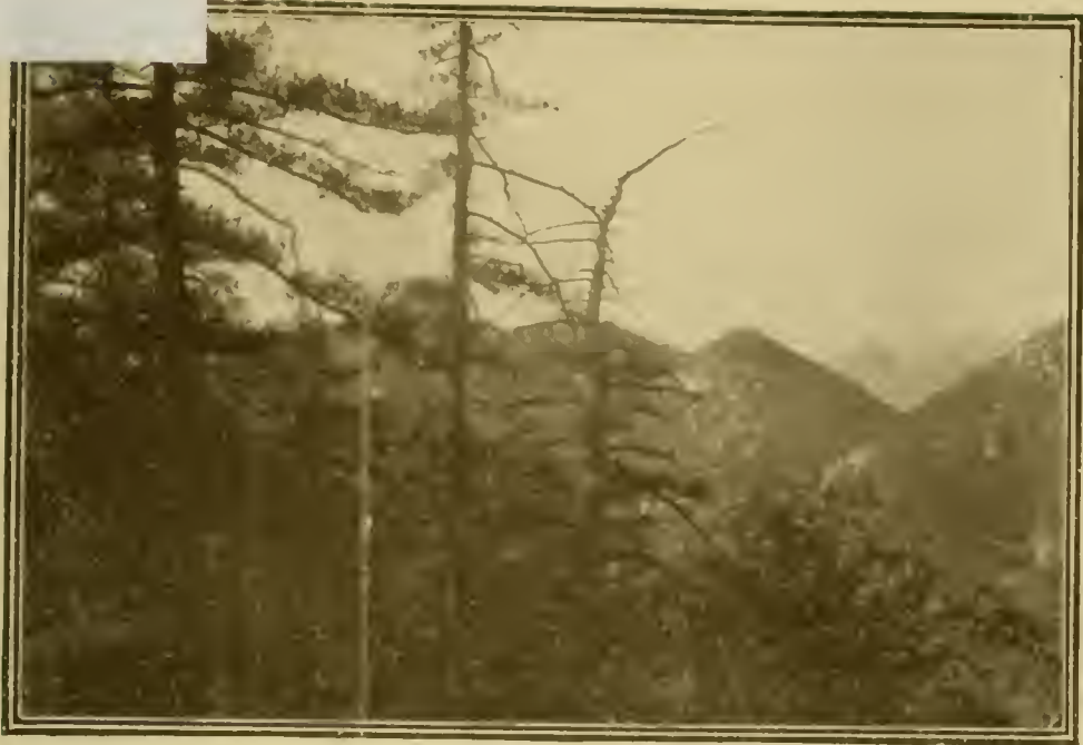
Looking off From Mt. Lowe

On the Lines of The Pacific Electric Ry.