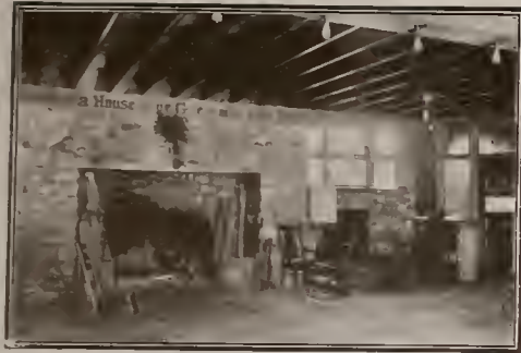
The Hospitality Fire Place at a Pine Tavern