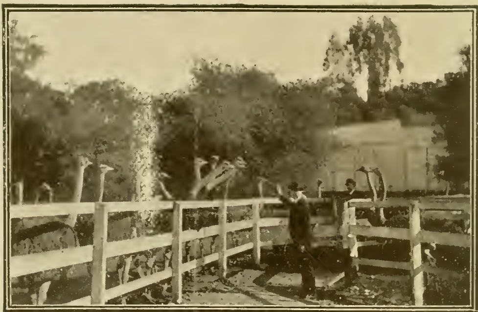
A Corner of the Ostrich Farm.