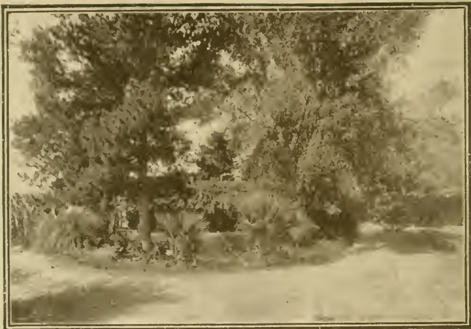
On a Country Road, Monrovia Way