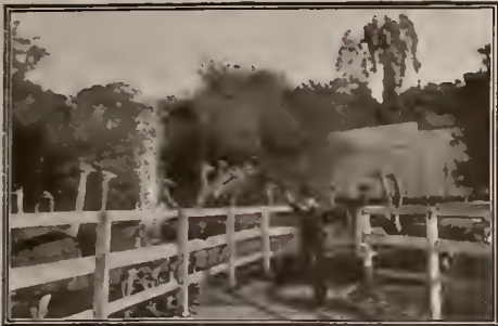
A View of the Ostrich Farm.