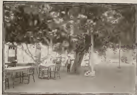
The Famous Ancient Grapevine of San Gabriel

Special rates by the week quoted on application.