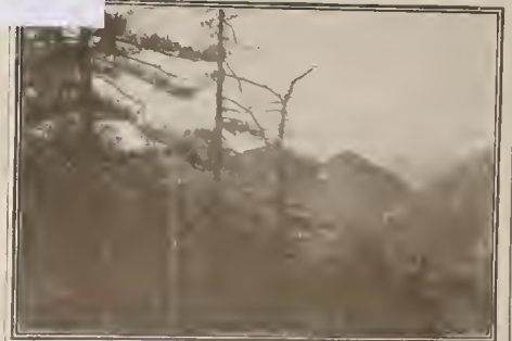
View of Mt. Low from the Trolley

On the Lines of The Pacific Electric Ry.