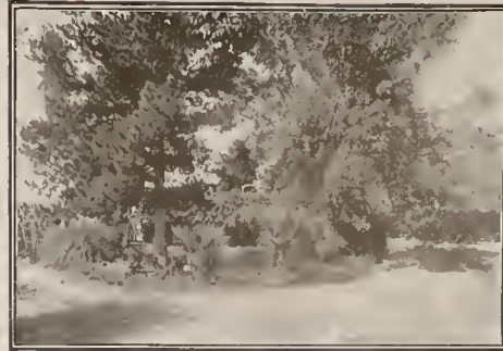
View of the Valley from the Trolley