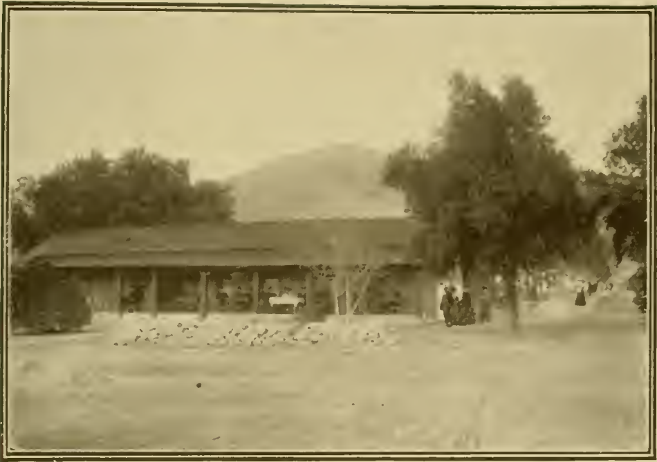
The Old Adobe Restaurant, "Casa Verdugo"