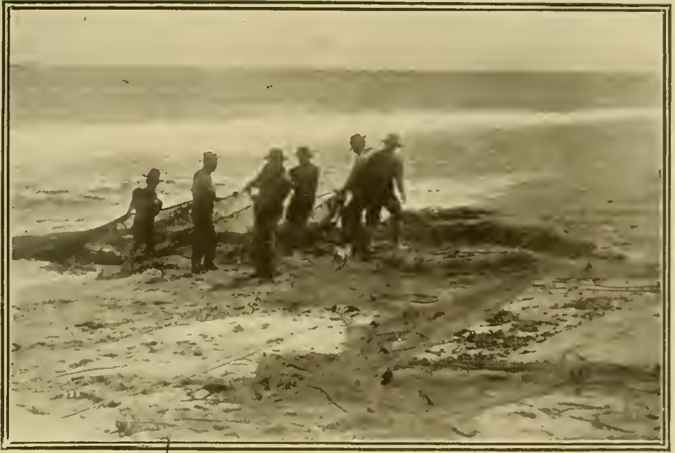
Drawing the Nets at Huntington Beach.