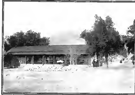
The Old Adobe Restaurant