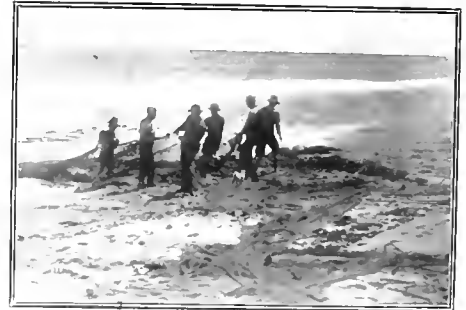
View of the Surf Route