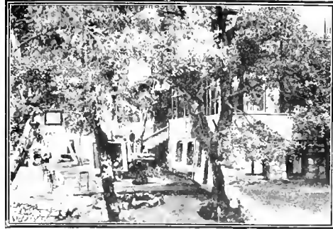
A Glimpse of the Alpine Tavern, 5000 feet above the sea

Through car from 6th and Main St. at 8, 9, 10, 11 a. m. and 1 and 3:30 p. m. Round trip fare $2.50. Special excursions Saturday and Sunday.