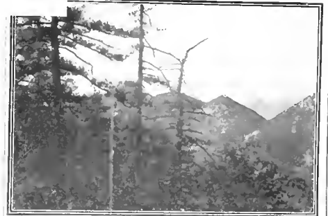
View of Rubio Canyon

On the Lines of The Pacific Electric Ry.