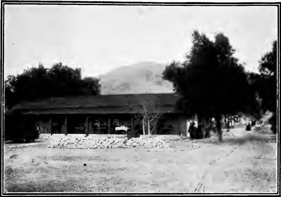
The Old Adobe Restaurant, "Casa Verdugo."