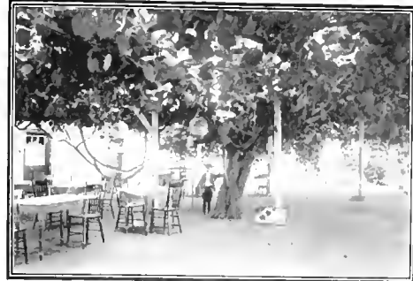
View of the Orange Grove Route

Special rates by the week quoted on application.