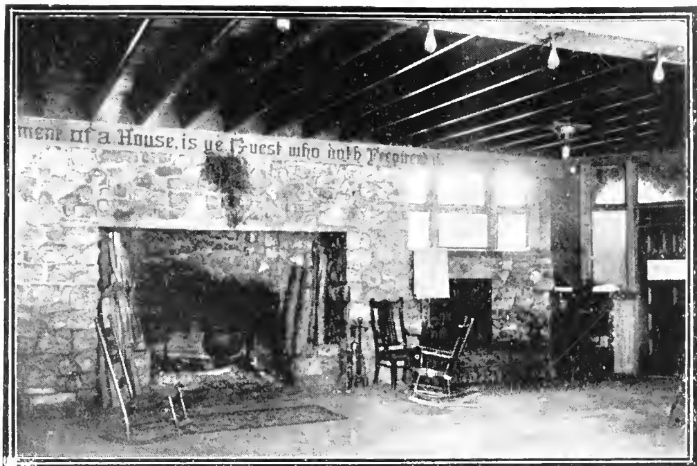
The Hospitable Fire Place at Alpine Tavern