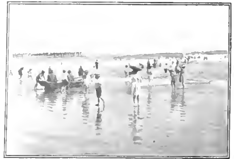
View of the Surf Route