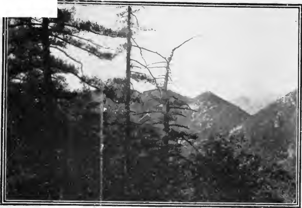
Looking off From Mt. Lowe

On the Lines of The Pacific Electric Ry.