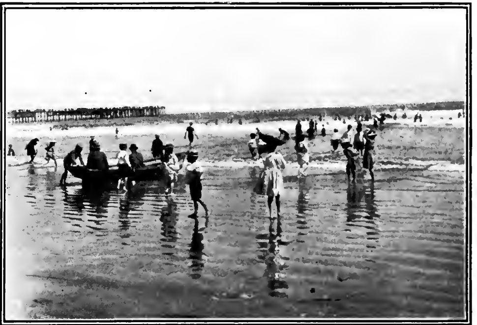
Children on the Sand at Long Beach.