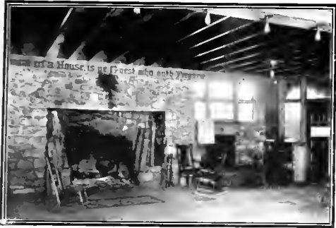
The Hospitable Fire Place at Alpine Tavern