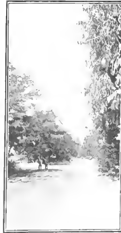
View of the Orange Grove Route