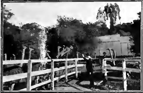
A Corner of the Ostrich Farm