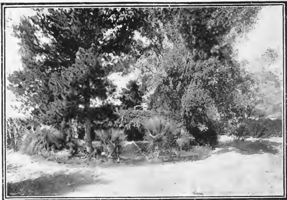
On a Country Road - Monrovia Way