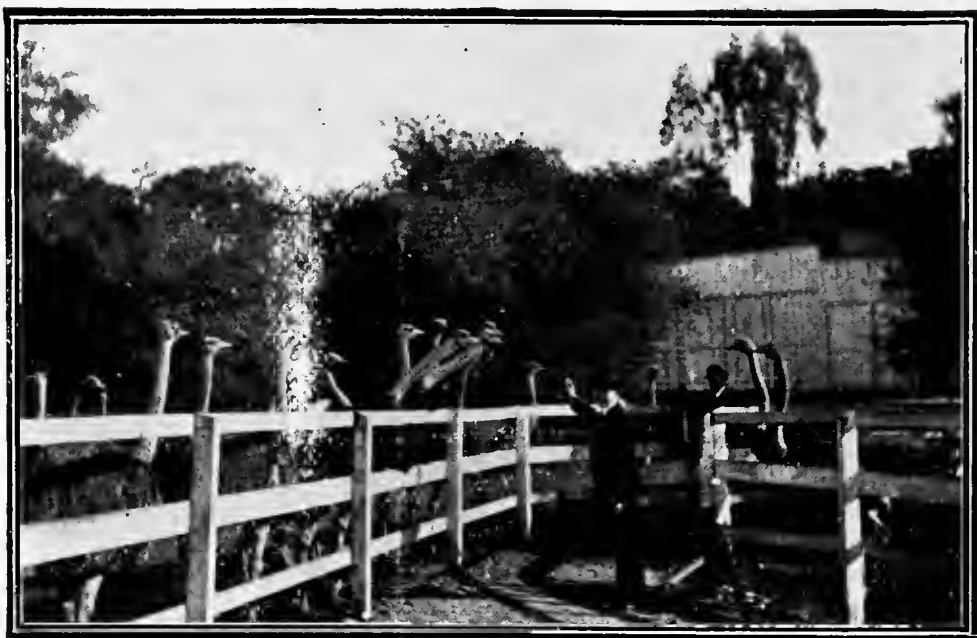
A Corner of the Ostrich Farm.