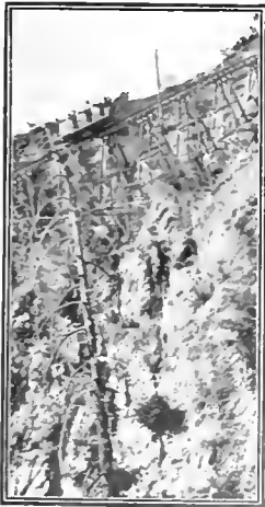
View of the Mountain Railway

The Most Marvelous Mountain Railway Journey in the World