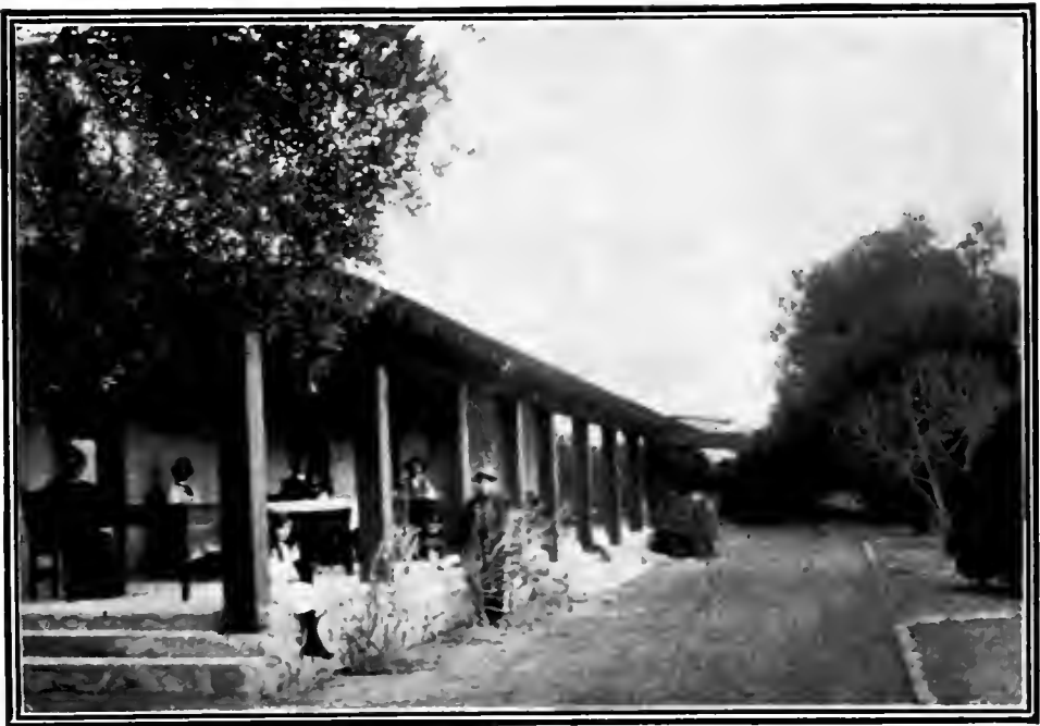
Eating "Hot Stuff" on the Broad, Cool Veranda, Casa Verdugo.

A DOUBLE daily parlor observation car service is maintained to North Glendale and the historic old home of the Verdugos, now converted into a typical Spanish restaurant. Car leaves Sixth and Main at 9:30 A. M. and 3 P. M. and the fare of $1.00 includes full Spanish dinner at Casa Verdugo. Tally-ho meets each car and for 50 cents extra the passenger is taken on a charming ride through the valley to Brand's Caynon. The whole trip is picturesque and beautiful.