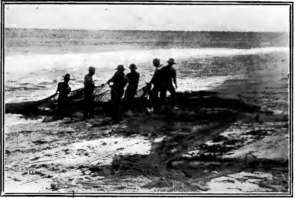
Drawing the Nets at Huntington Beach.