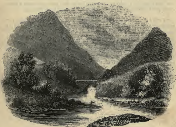
SALMON LEAP AT PONT ABERGLASLLYN.