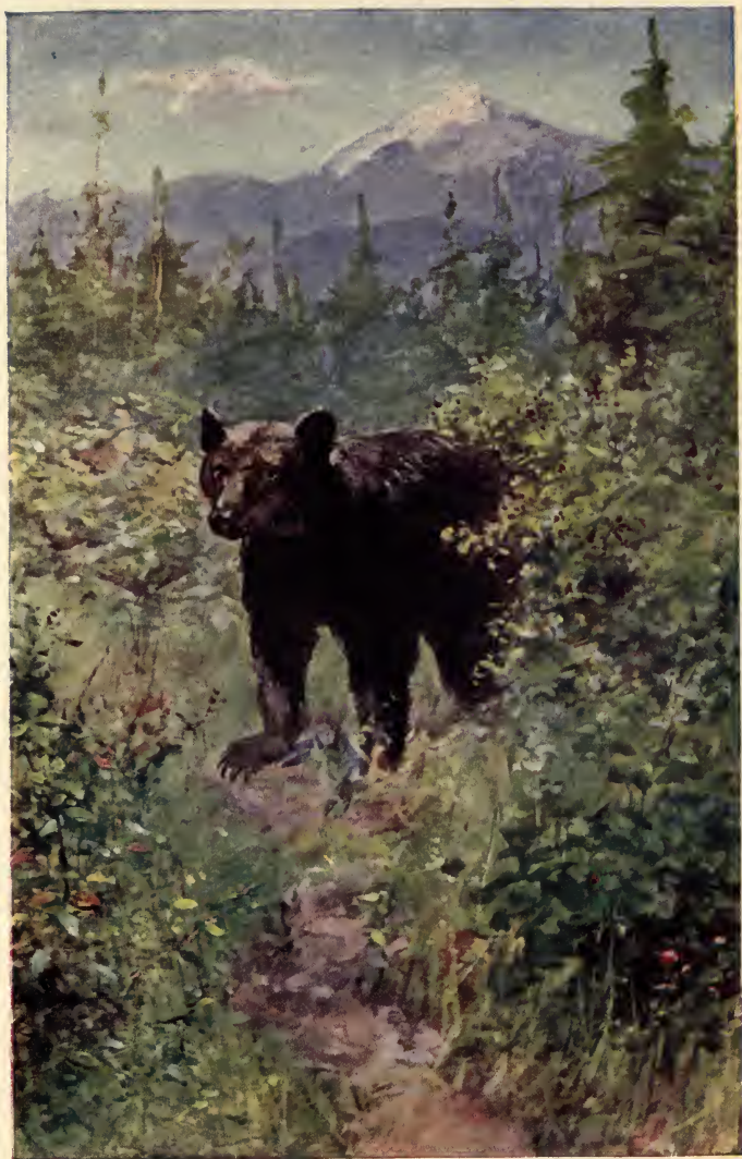
Large Black Bear.—Page 250.