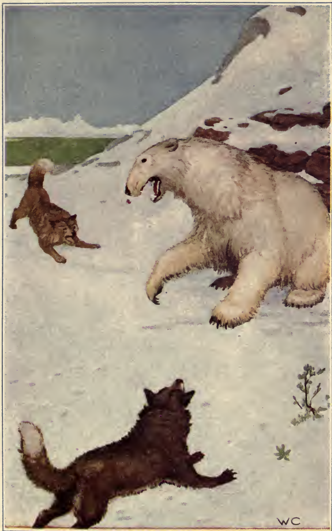
Pressed more severely, the bear stands at bay.—Page 155.