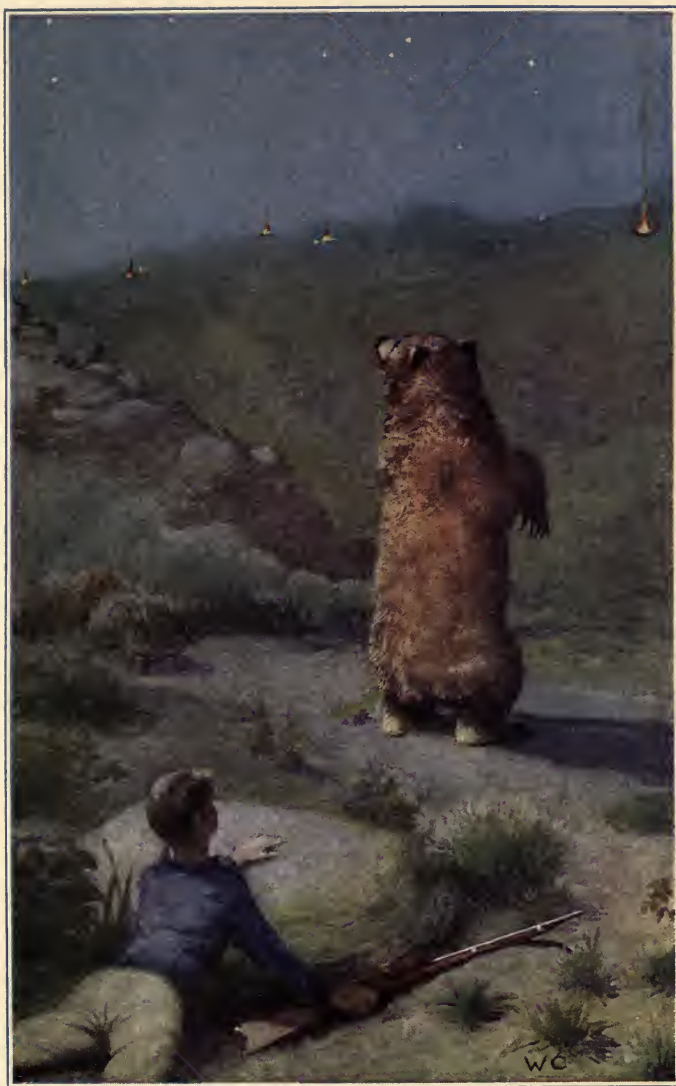
He threw his enormous bulk back on his haunches, and rose up.—Page 40.