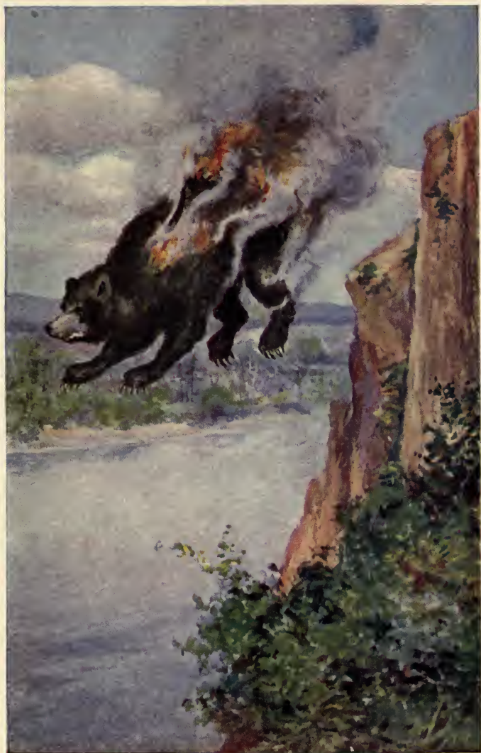
Into the water leaped a black bear.—Page 26.