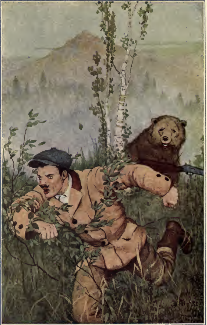
Of course he dropped his gun.—Page 107.