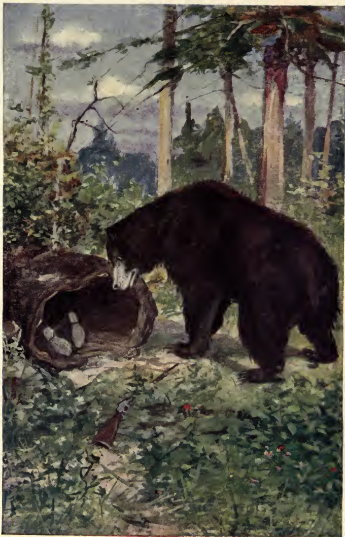
The bear was waiting there.—Page 111.