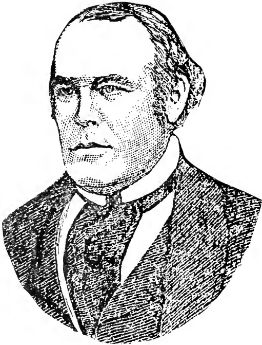
PARLEY PARKER PRATT.