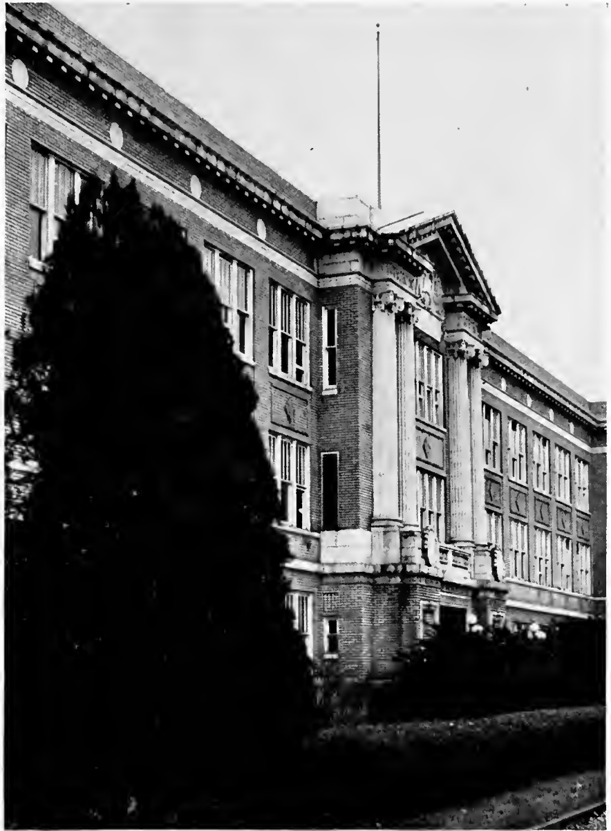
TUBMAN HIGH SCHOOL