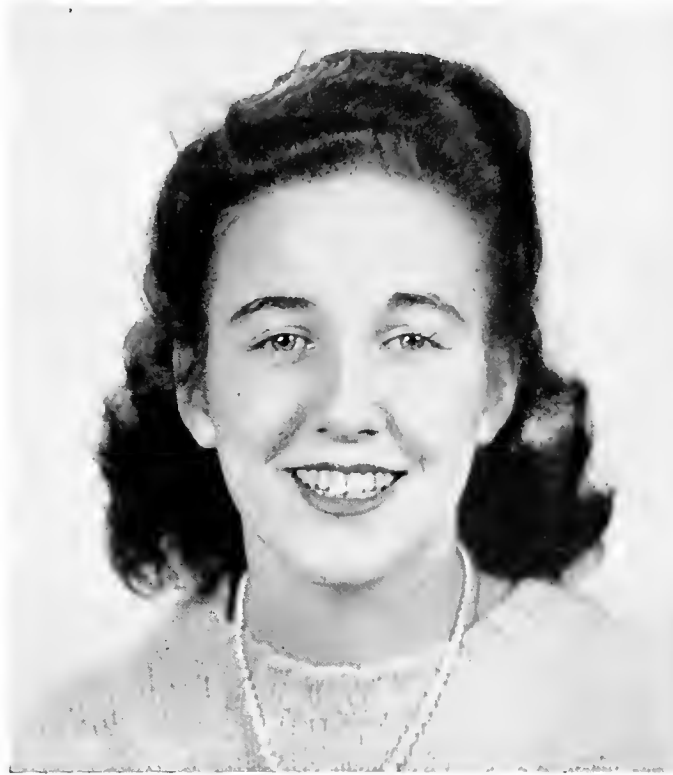
MISS TUBMAN HIGH