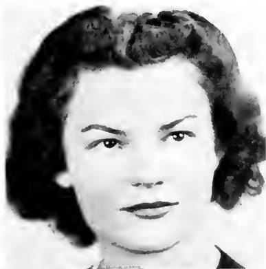
MOST LIKELY TO SUCCEED